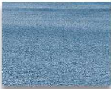
LIGHT BLUE 1455