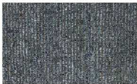
MIX ART 01