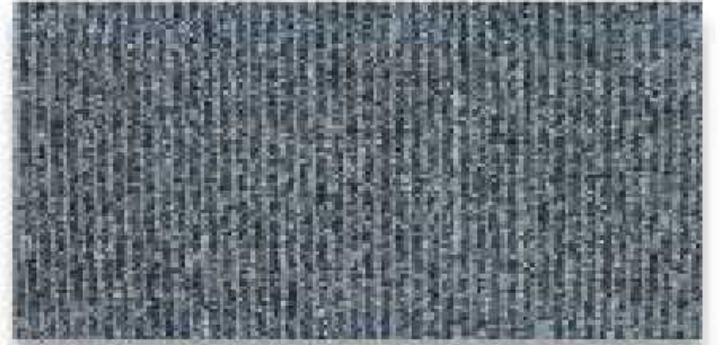
MIX ART 07