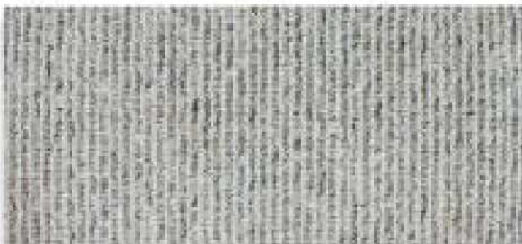
MIX ART 05