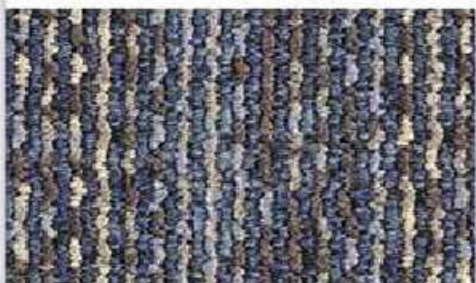
MIX ART 01