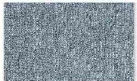
MIX ART 06