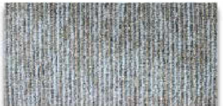
MIX ART 04