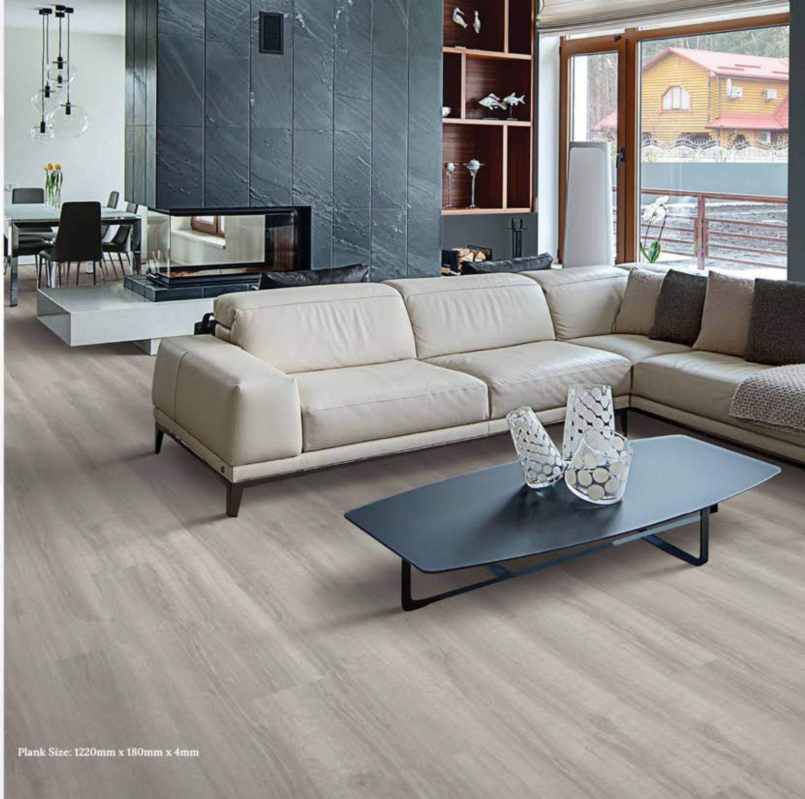
Plank Size: 1220mm x 180mm x 4mm