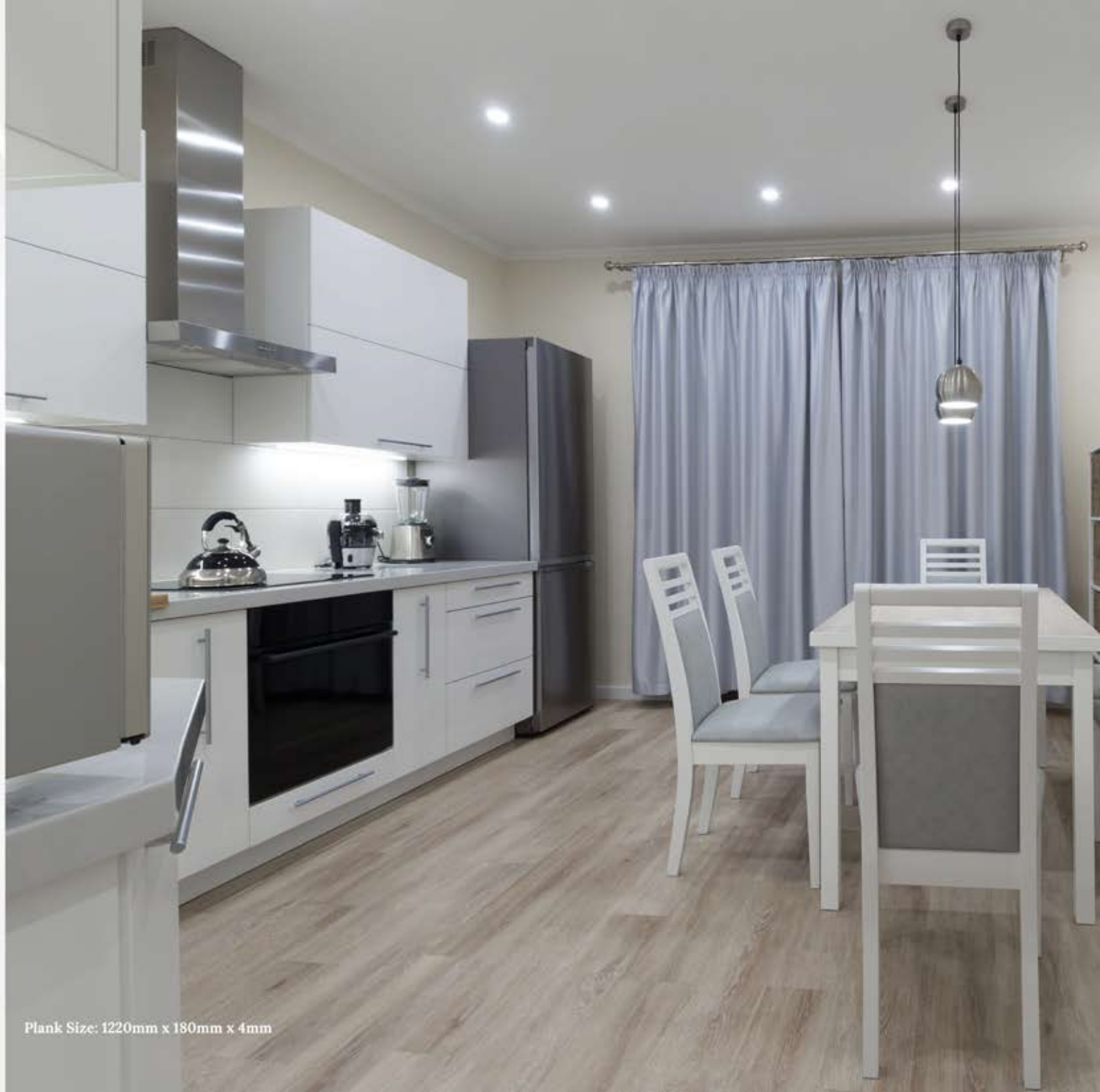
Plank Size: 1220mm x 180mm x 4mm