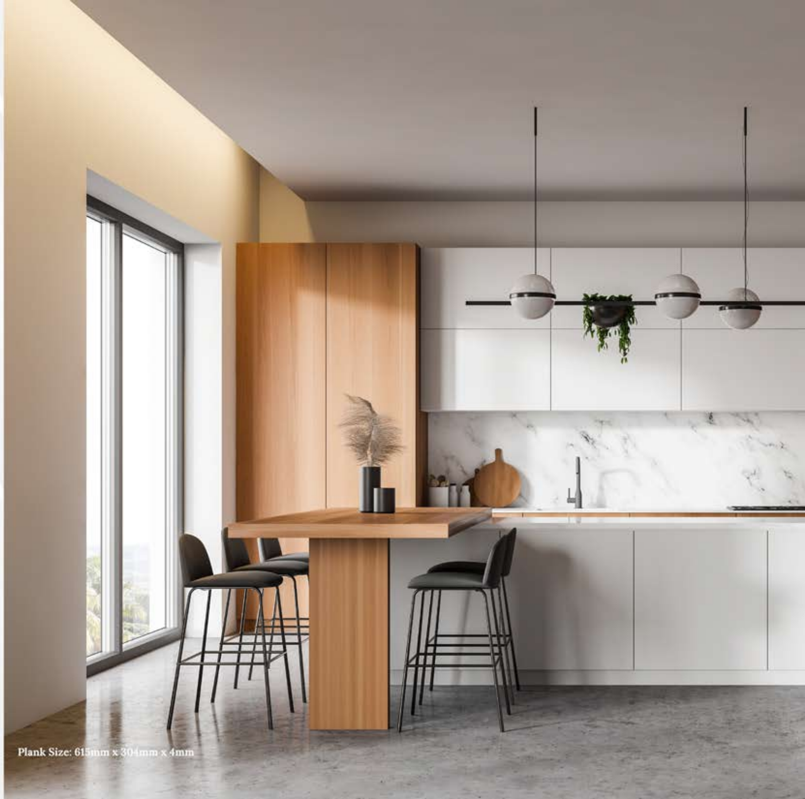
Plank Size: 615mm x 304mm x 4mm