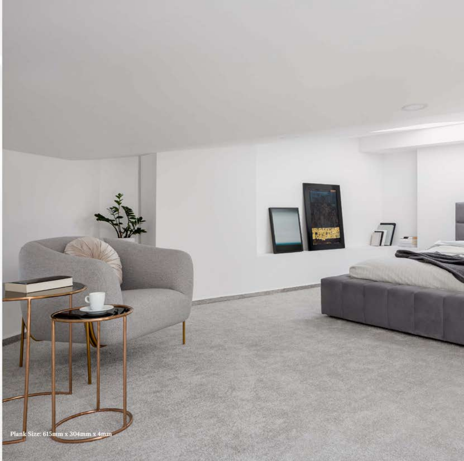
Plank Size: 615mm x 304mm x 4mm