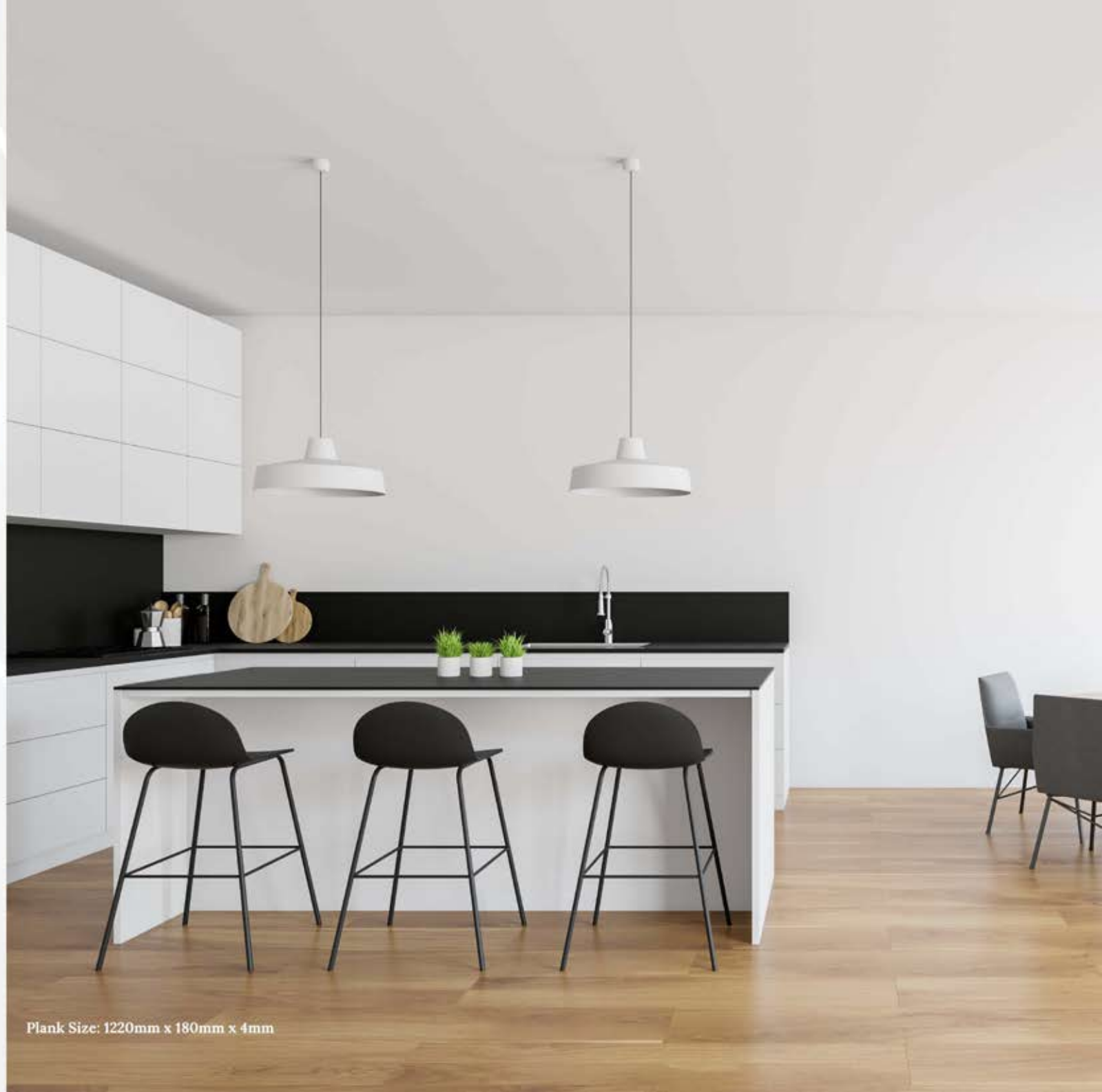
Plank Size: 1220mm x 180mm x 4mm