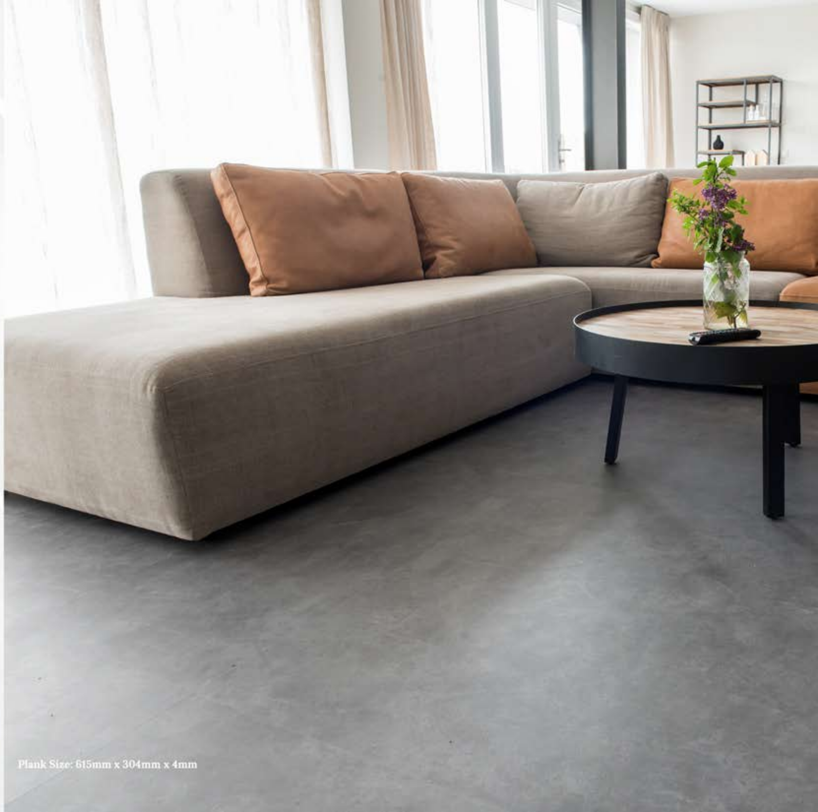
Plank Size: 615mm x 304mm x 4mm