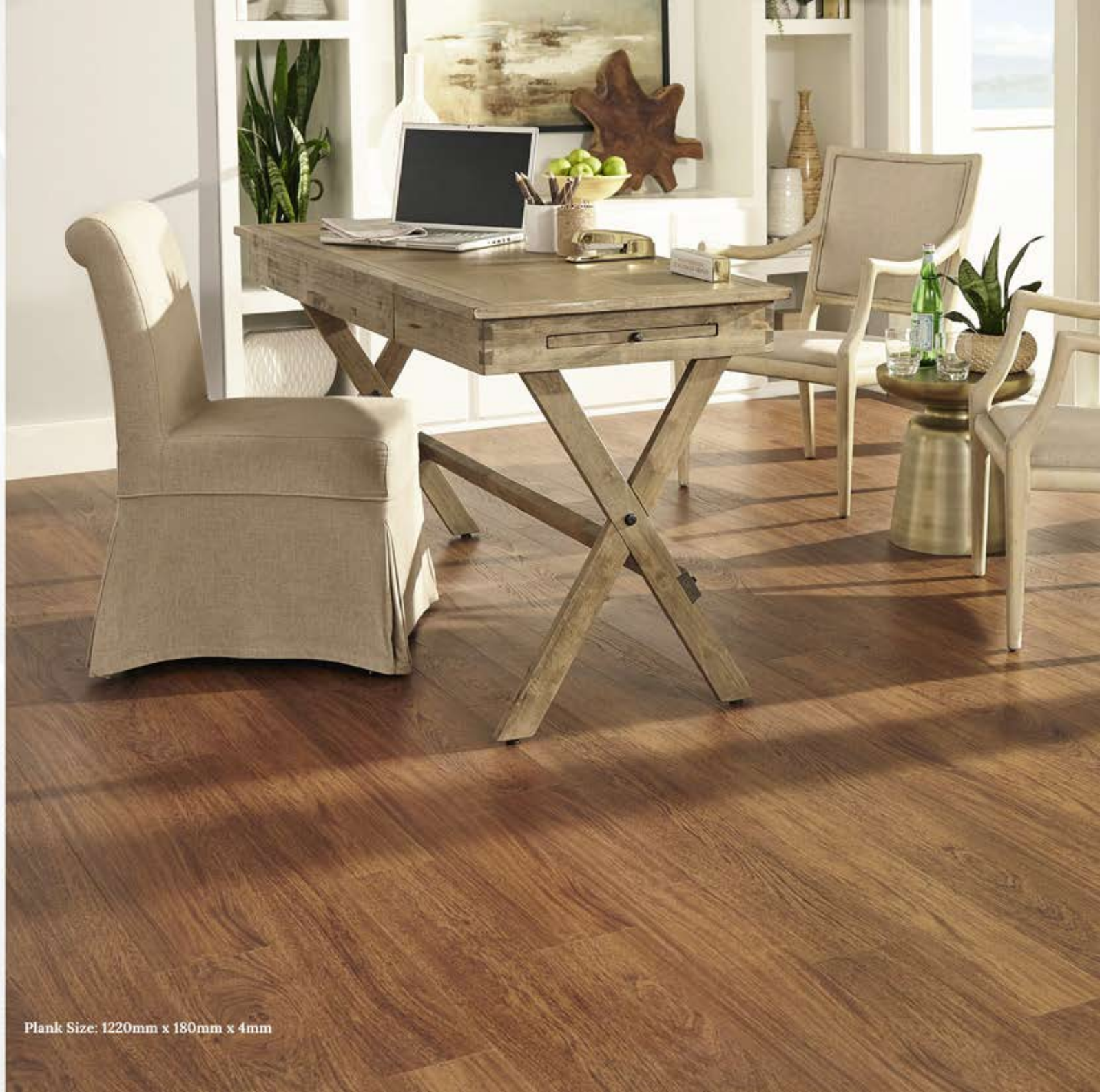
Plank Size: 1220mm x 180mm x 4mm