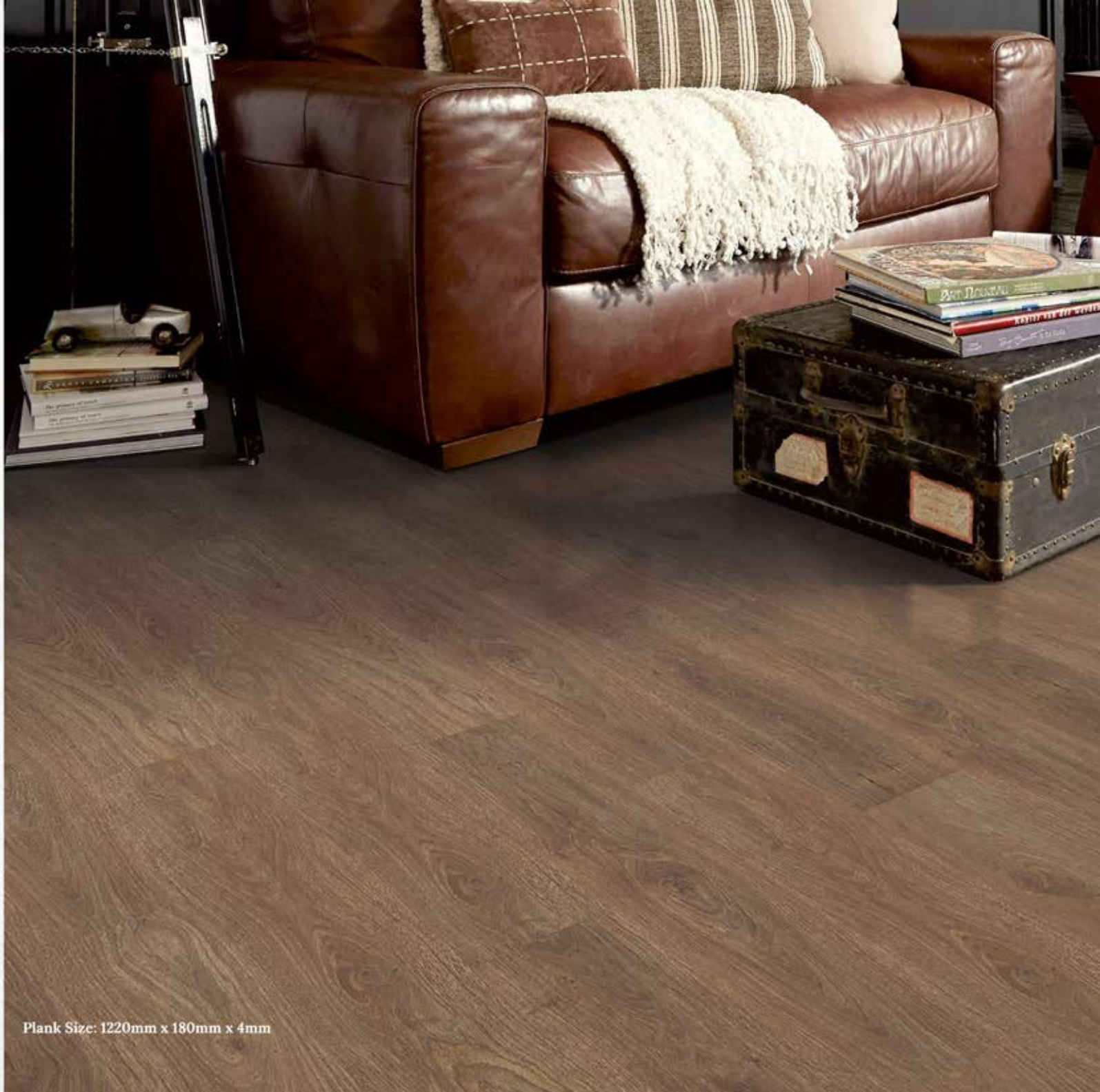
Plank Size: 1220mm x 180mm x 4mm