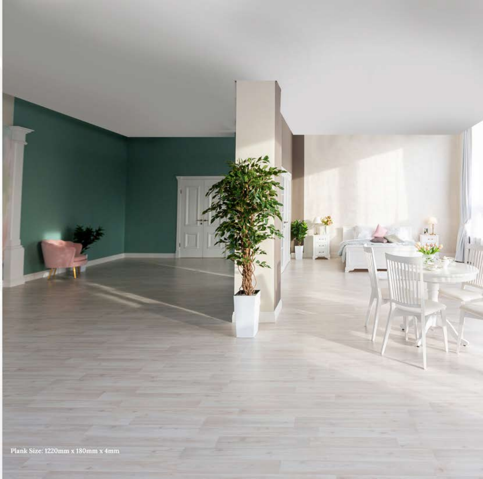
Plank Size: 1220mm x 180mm x 4mm