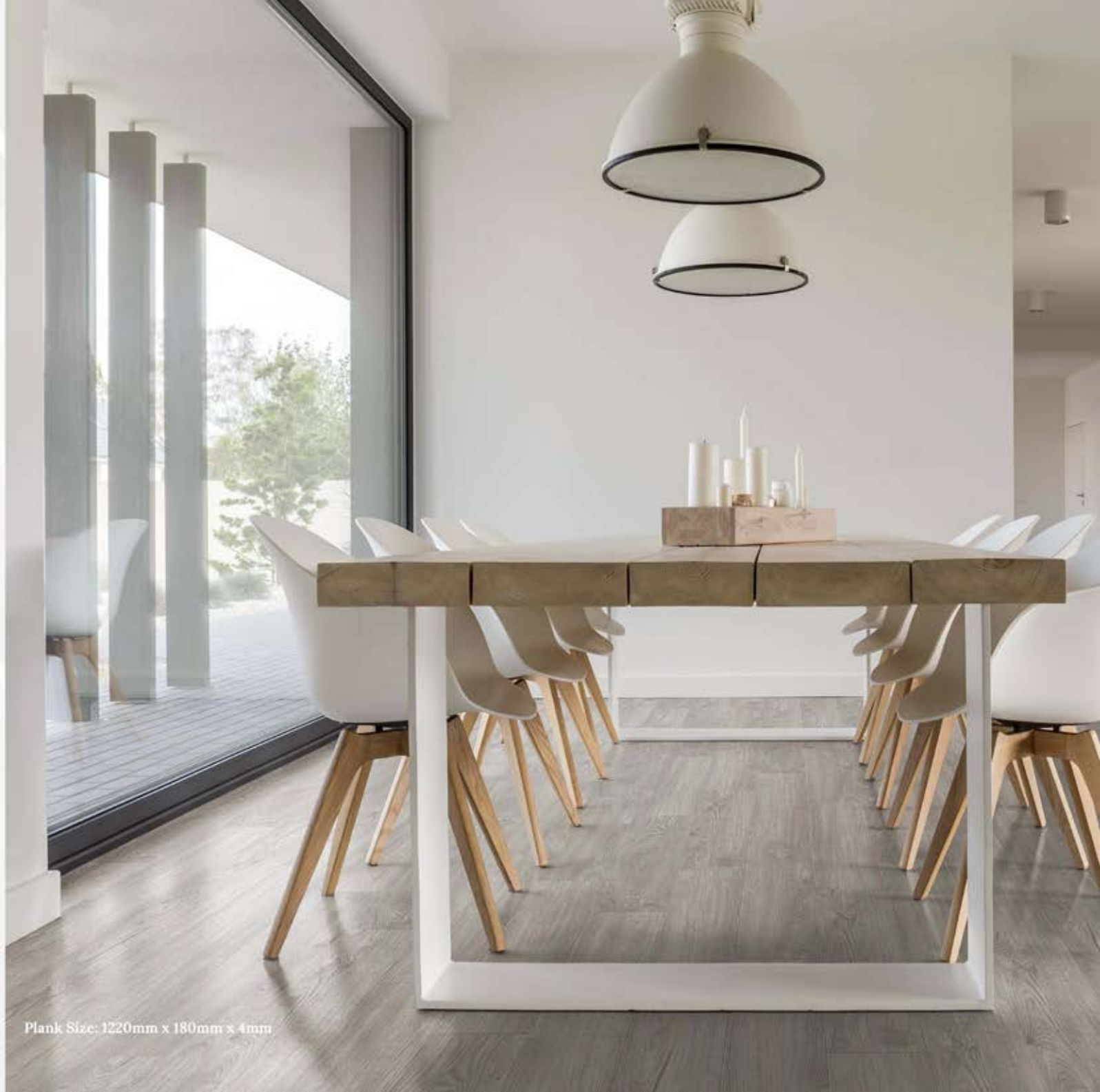
Plank Size: 1220mm x 180mm x 4mm