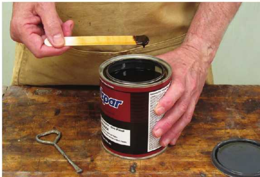
Pigment. Pigment settles to the bottom of the can and has to be stirred into suspension before use. Because the pigment particles are solid, they require a binder (some type of finish) to glue them to the wood.

Why stain? One of the principal reasons to stain wood, especially lighter woods such as this birch plywood, is to make them resemble more desirable darker woods, in this case walnut.