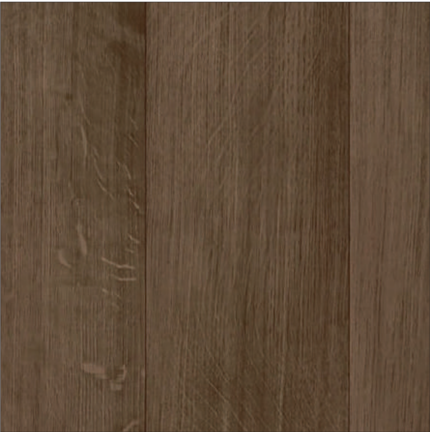
Intense Brown 25099 114