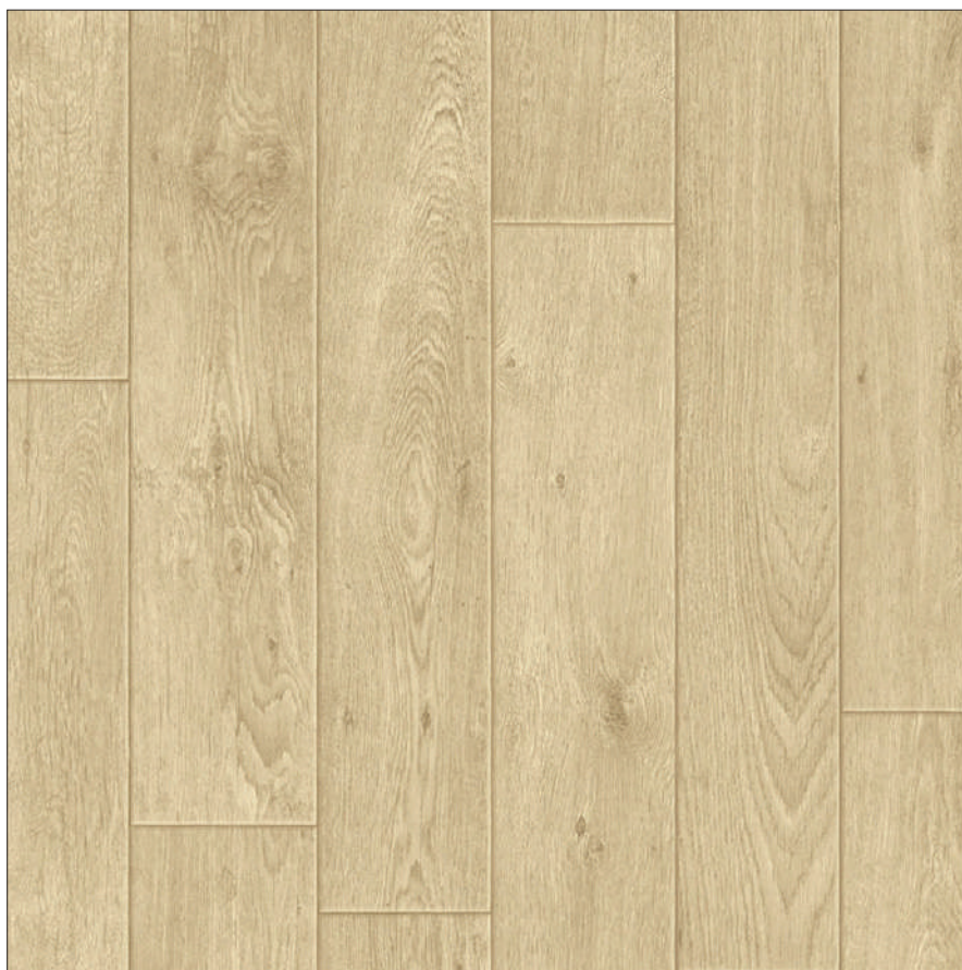
Warm Beige 25099 073