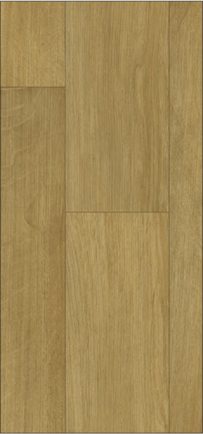
Middle Natural 25099 074