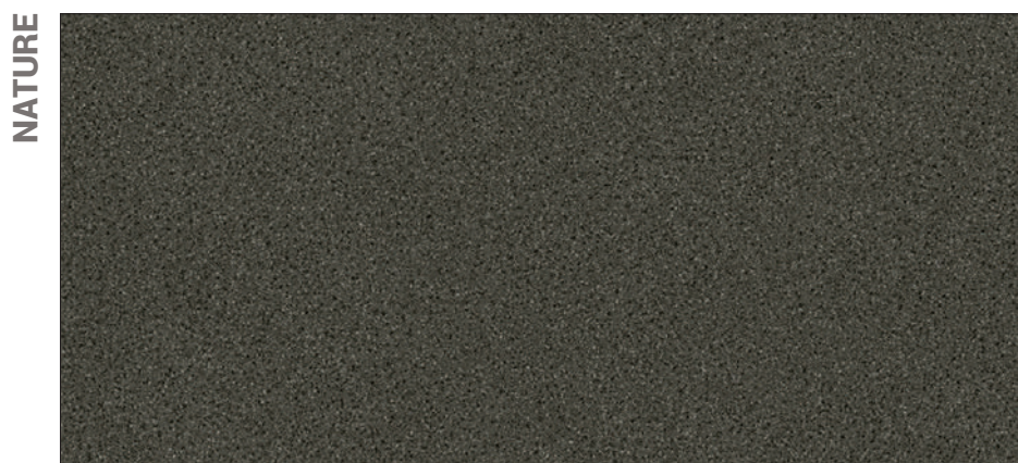
Black 25144 046