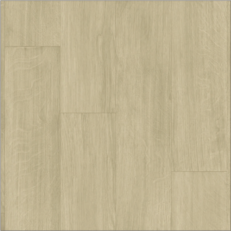
Natural Beige 25099 076