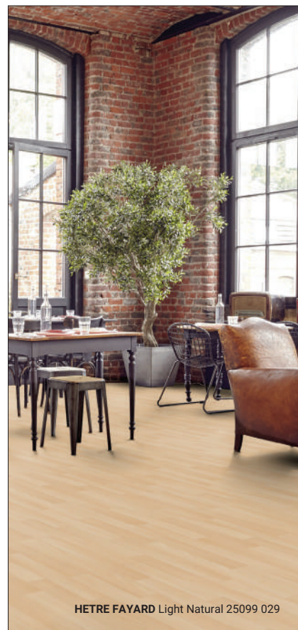
HETRE FAYARD Light Natural 25099 029