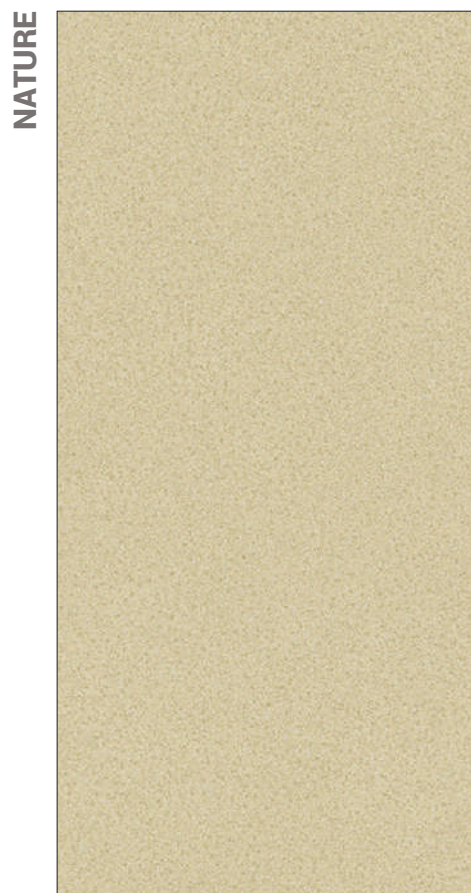
Middle Grege 25144 052