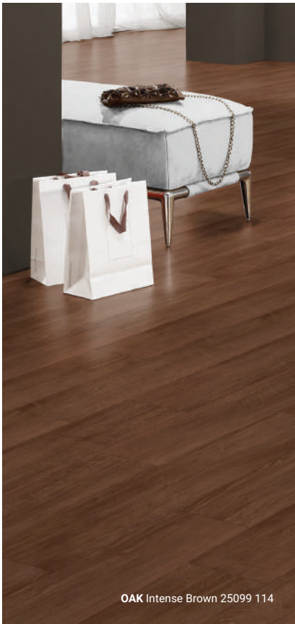
OAK Intense Brown 25099 114