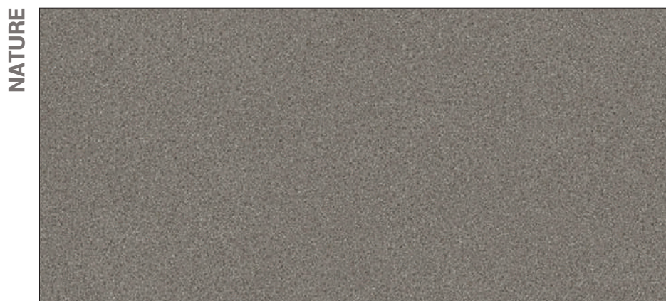
Cold Dark Grey 25144 045