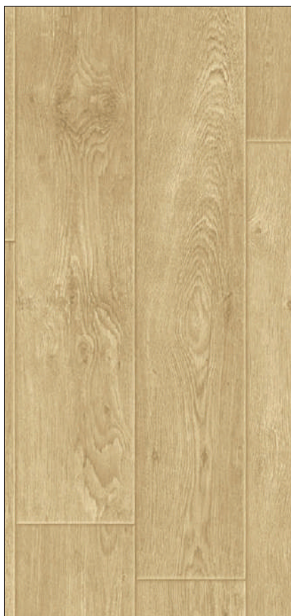
Natural 25099 034