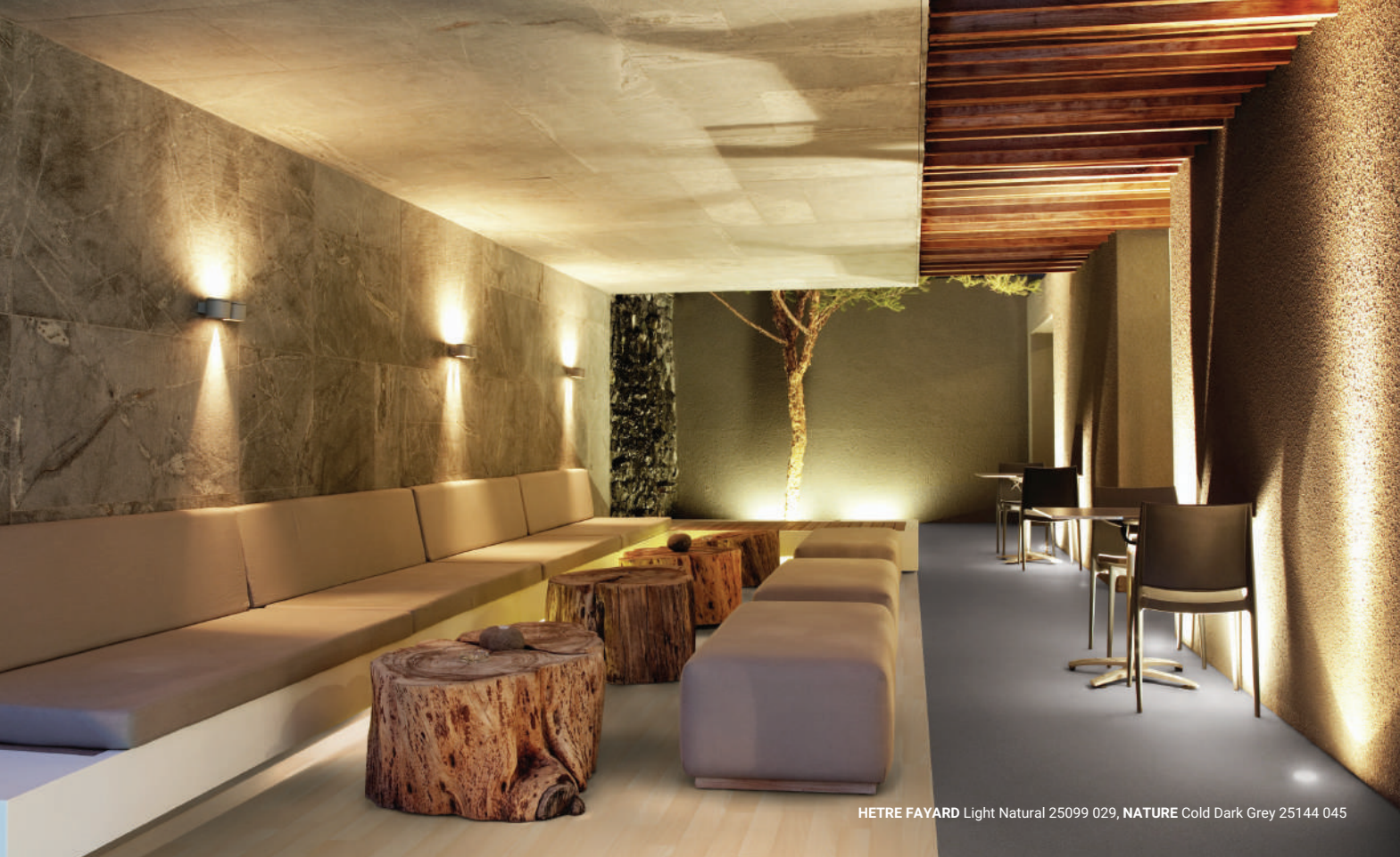
HETRE FAYARD Light Natural 25099 029, NATURE Cold Dark Grey 25144 045

Ideal for heavy traffic commercial areas, especially in Education, Healthcare and Aged Care facilities, RUBY 70 is available in both compact and acoustic versions. The new embossing has been developed to reduce maintenance and save you time and money. RUBY 70 offers trendy colours and decors with a large range of LRVs allowing you to play with light and contrast in your installation, without having to compromise on technical performance.