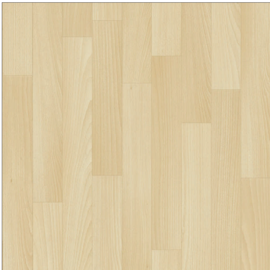
Light Natural 25099 029