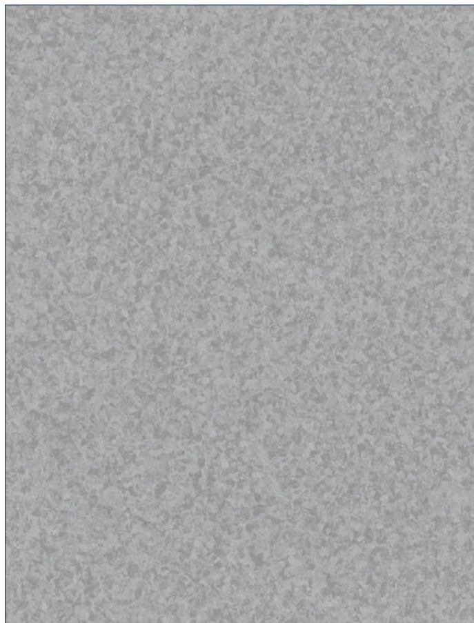
Medium Cool Grey