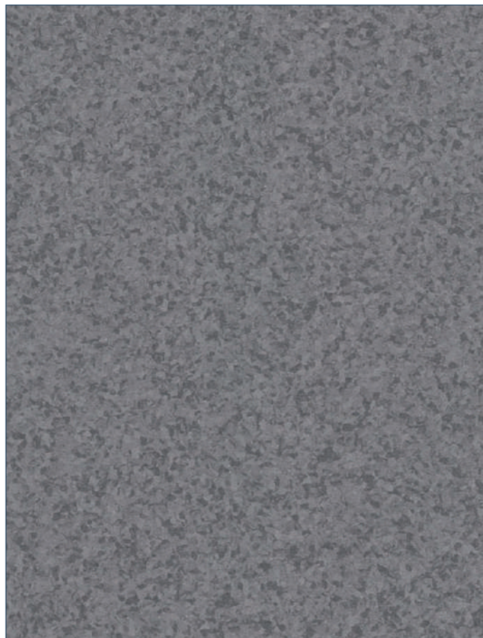
Dark Cool Grey