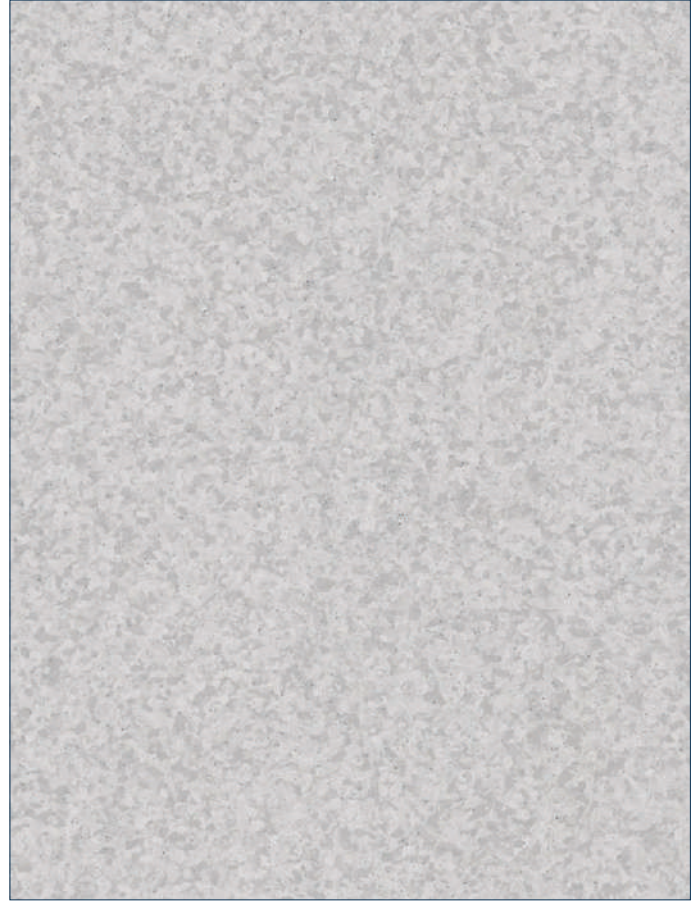
Light Pure Grey