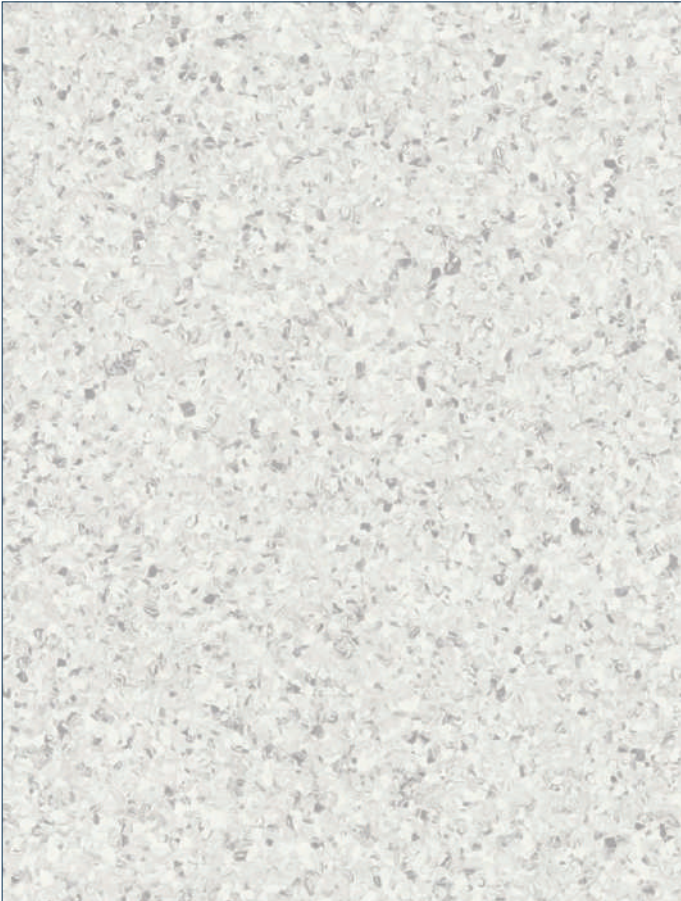
Light Pure Grey