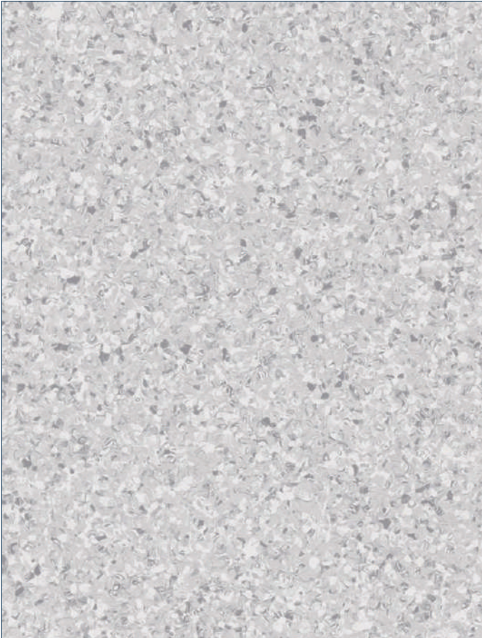
Medium Pure Grey