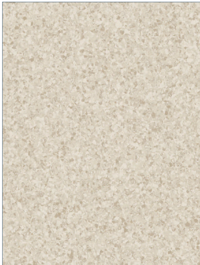
Medium Warm Beige