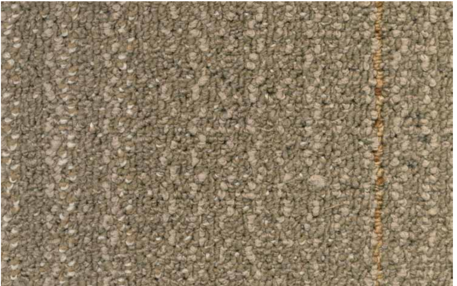
Tapioca Pudding (42102)