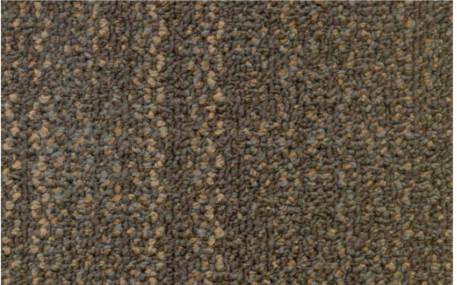
Chai Latte (83098)