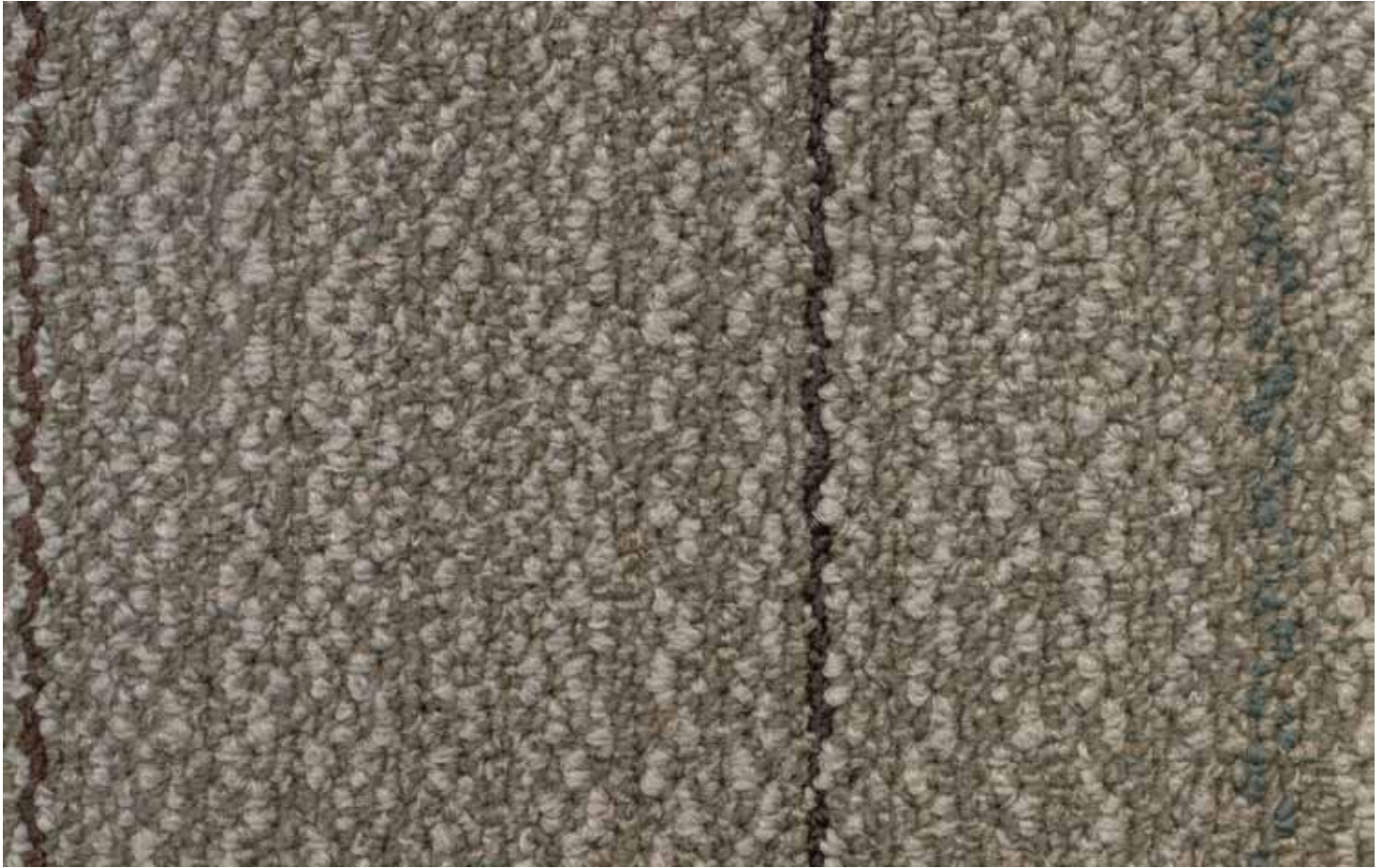
Cookies n Cream (14107)