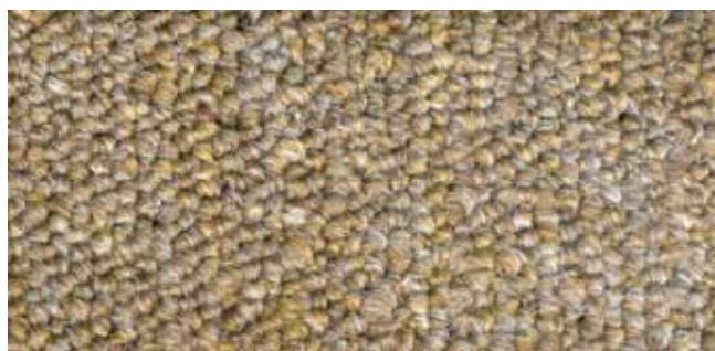
ST-31 Coffee Brown