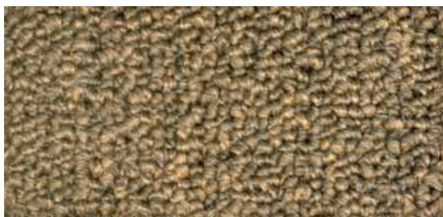
ST-22 Yellow Brown