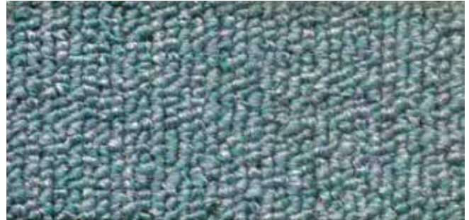
ST-13 Diamond Green