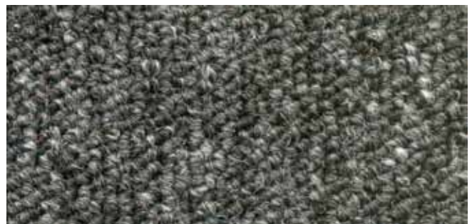
ST-09 Night Grey