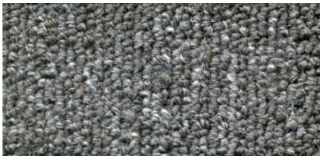
ST-06 Dark Grey