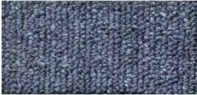
ST-29 Dark Blue