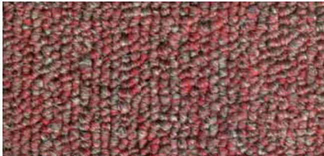
ST-14 Grey Red