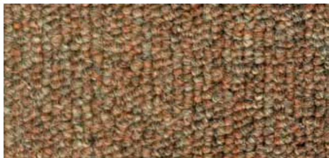
ST-68 Red Brown