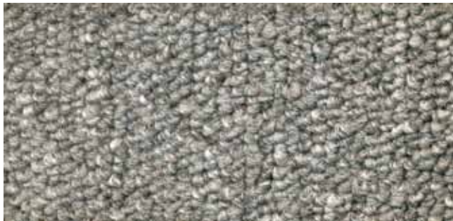
ST-04 Normal Grey