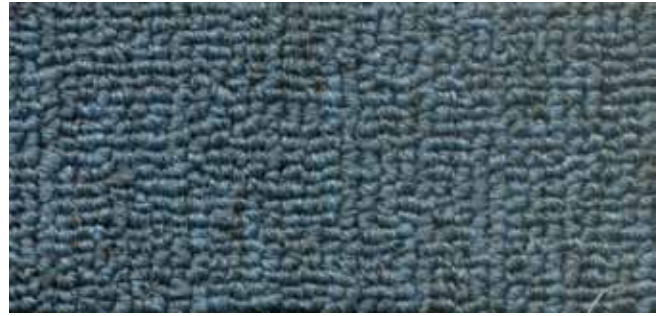
ST-88 Jewel Blue