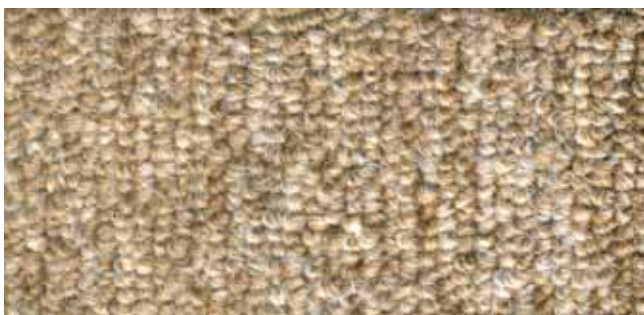
ST-78 Light Brown