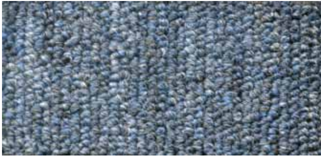
ST-12 Normal Blue