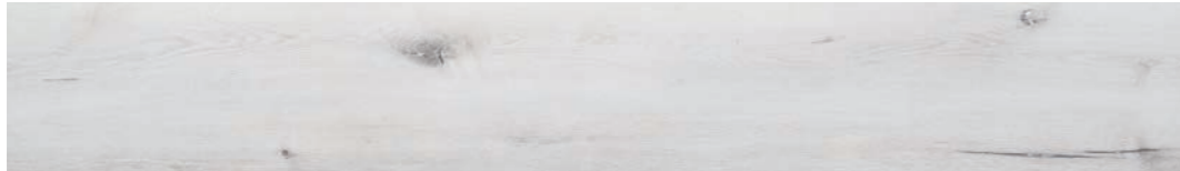
COUNTRY WHITE GREY

DIMENSIONS: gluedown 55: 1520 x 237 mm | click comfort 55: 1511 x 228 mm