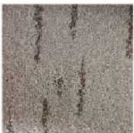
OFF WHITE 1690