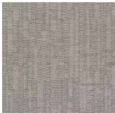
23401 Light Grey