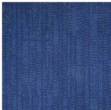
23409 Dark Blue