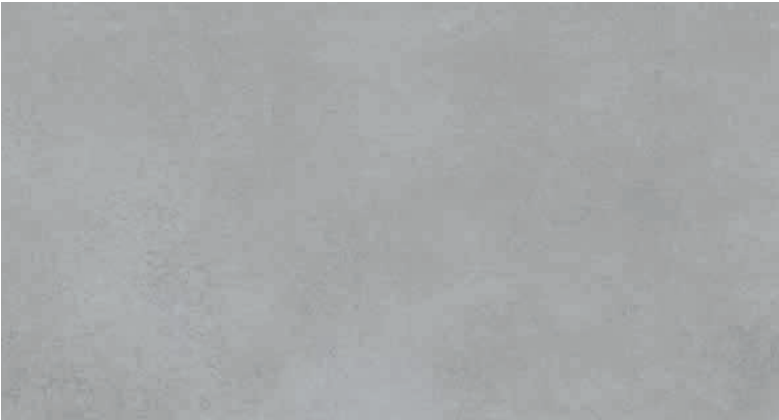
ES1722362 AUTHENTIC CONCRETE - TITANIUM