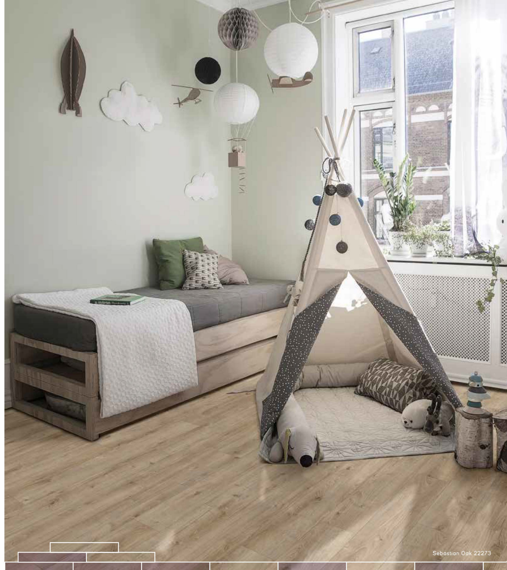
Sebastian Oak 22273