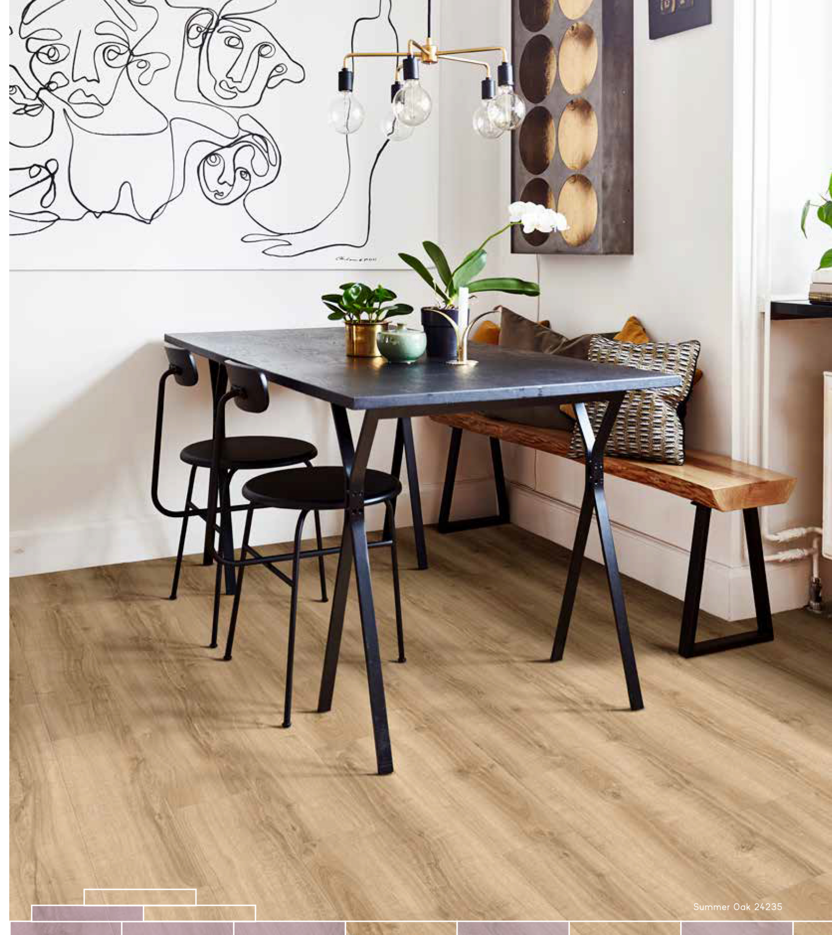
Summer Oak 24235