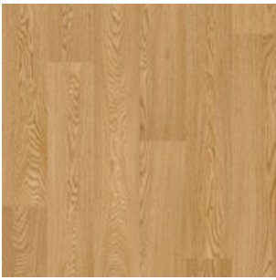
Classic Oak 3100