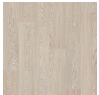
Oiled Oak 2990