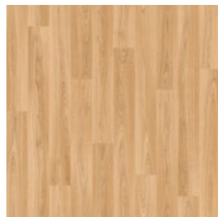
American Oak 3380