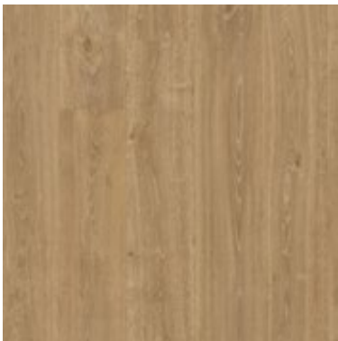
English Oak 9823