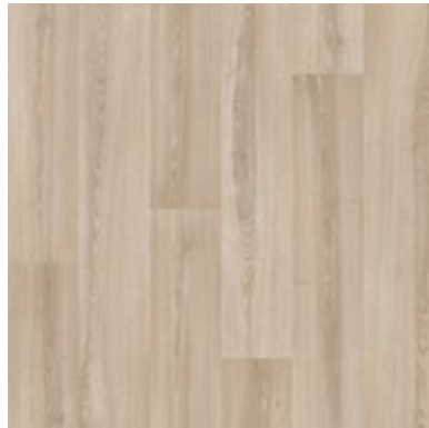
Warm Limed Ash 9832