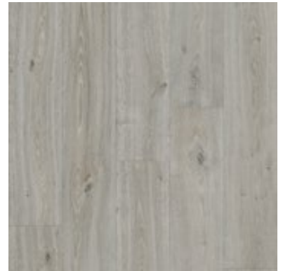
Silver Oak 9826