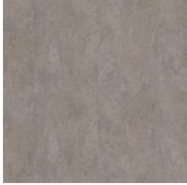
Dark Industrial Concrete 9859