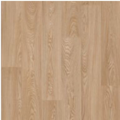
Blond Oak 9820