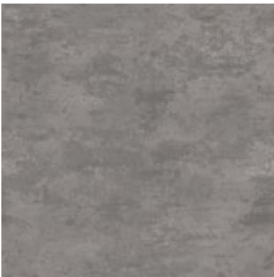
Cool Concrete 9856