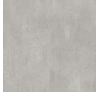
Light Grey Concrete 9858