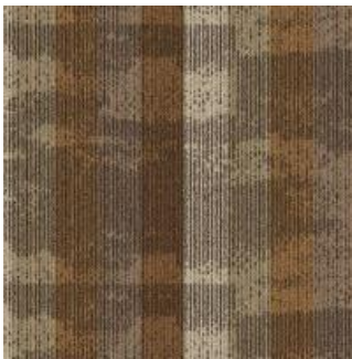
F4-01 BROWN BEIGE