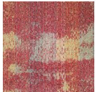
F4-04 BROWN RED