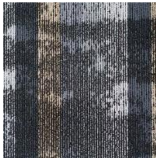
F4-03 MULTI GREY