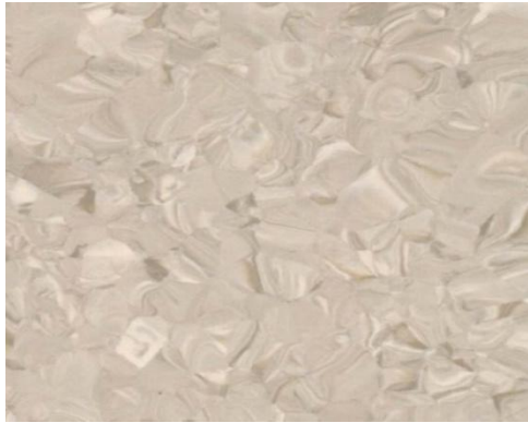
Cold Beige 04-100011