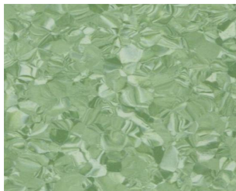
Light Green 04-100007