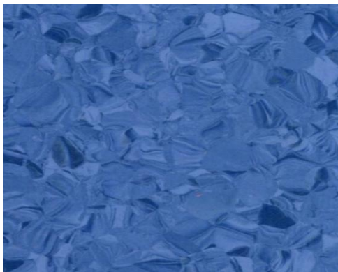
Dark Blue 04-100009