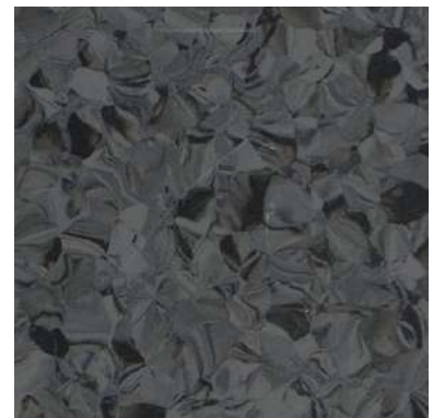
Meditime 4530 Charcoal Grey