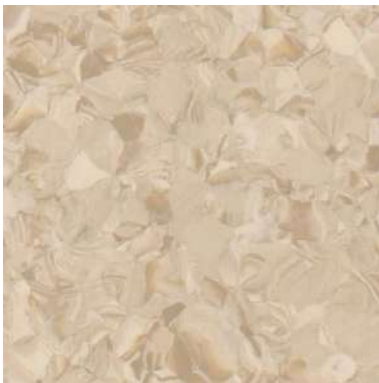
Meditime 4505 Tan