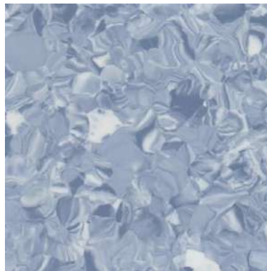
Meditime 4515 Light Blue