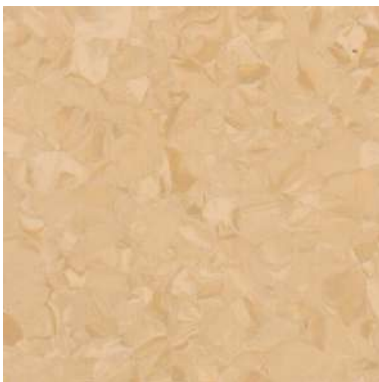
Meditime 4502 Beige