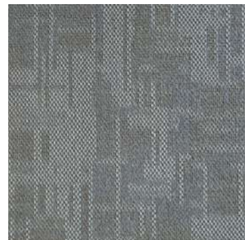
Matrix 7605 Metal Grey