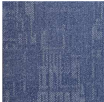
Matrix 7606 Glacier Grey