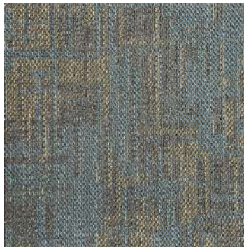
Matrix 7633 Teal Green