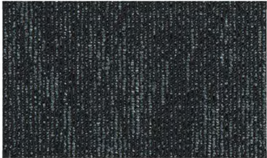
5312 - GRAPHIT