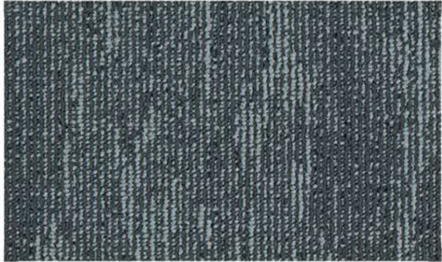
5311 - FOG