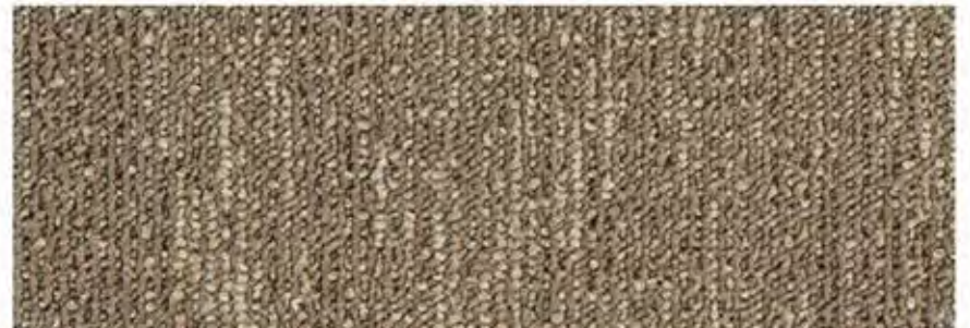
5315 - CAMEL