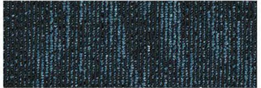
5314 - DENIM