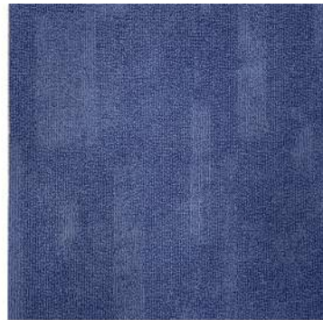
Insight 7124 Sea Blue