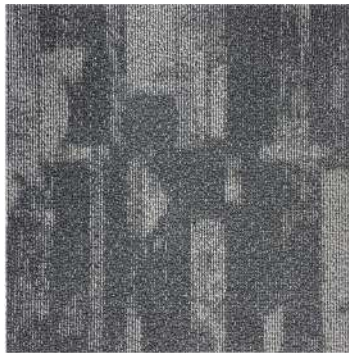
Insight 7125 Light Grey