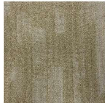
Insight 7126 Sand Beige