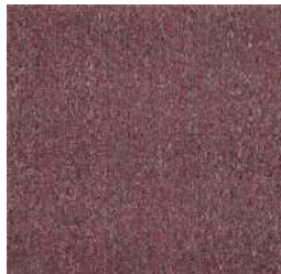
90 LIGHT RED