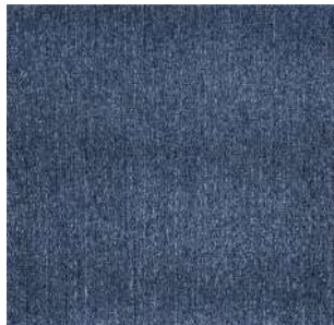
85 DARK BLUE