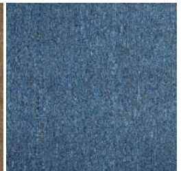
84 SKY BLUE