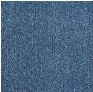
86 OCEAN BLUE