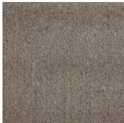
81 LIGHT BROWN