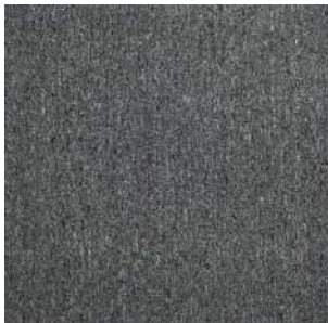
87 LIGHT GREY