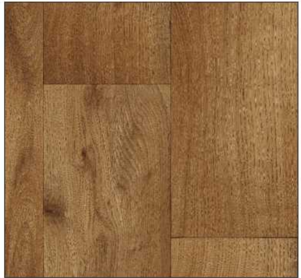
Arcadia MIDDLE BEIGE - 5203048