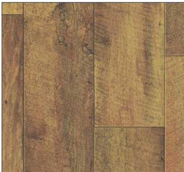
Authentic BEIGE - 5203069