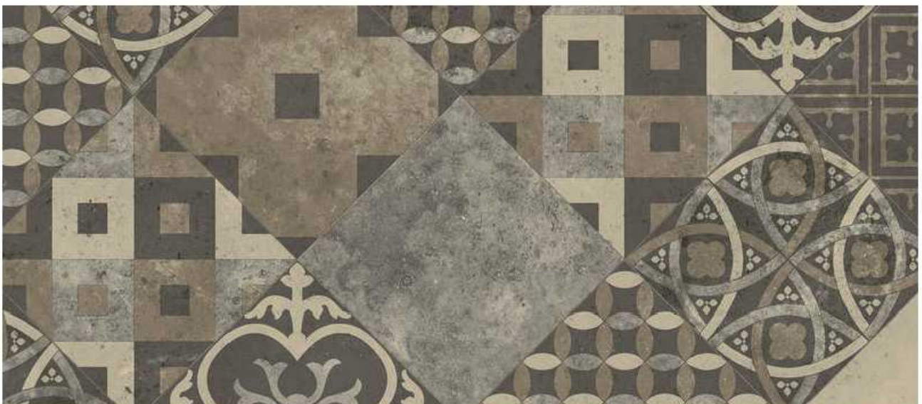
Zaragoza Tile STONE - 5203102