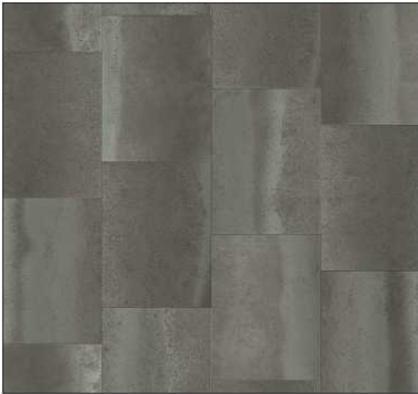
Kaolin DARK GREGE - 5203094