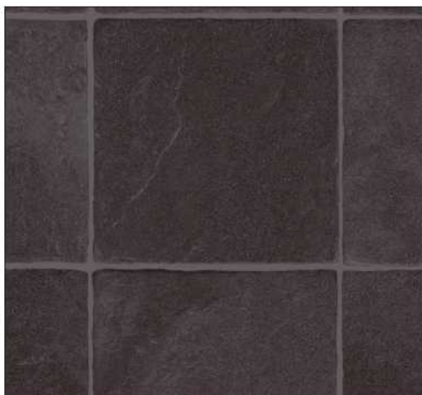
Granit CARBON - 5203058