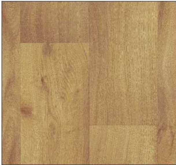
Arcadia BEIGE - 5203067