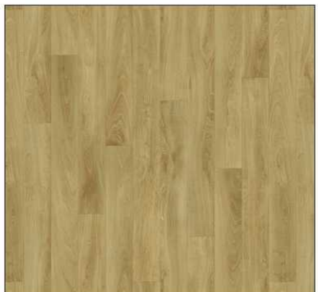
French Oak MEDIUM BEIGE - 5203087