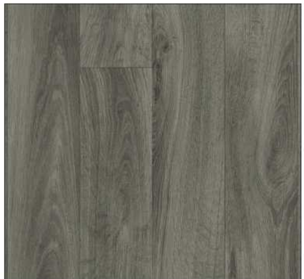
French Oak ANTHRACITE - 5203086