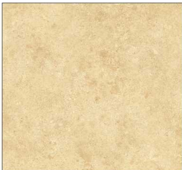
Agrego GREGE - 5203045