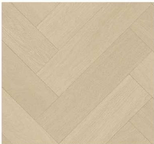
Ancares Herringbone Beige - 5203108