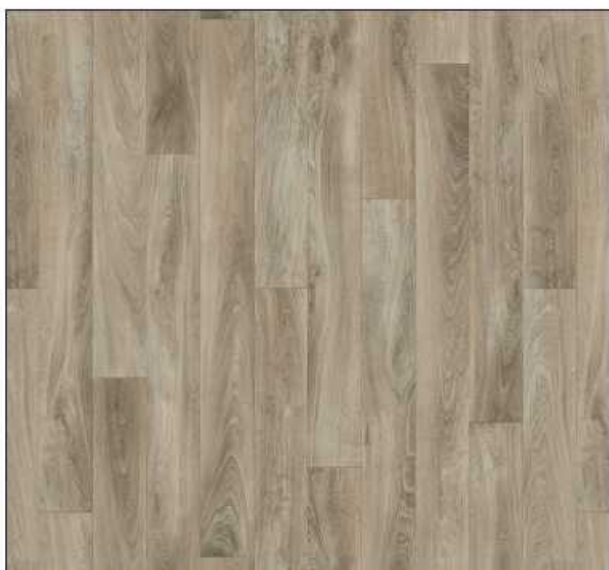
French Oak GREGE - 5203107