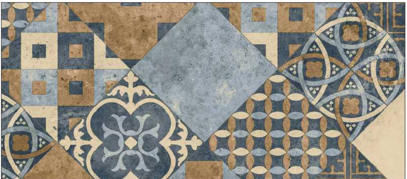
Zaragoza Tile INDIGO - 5203100