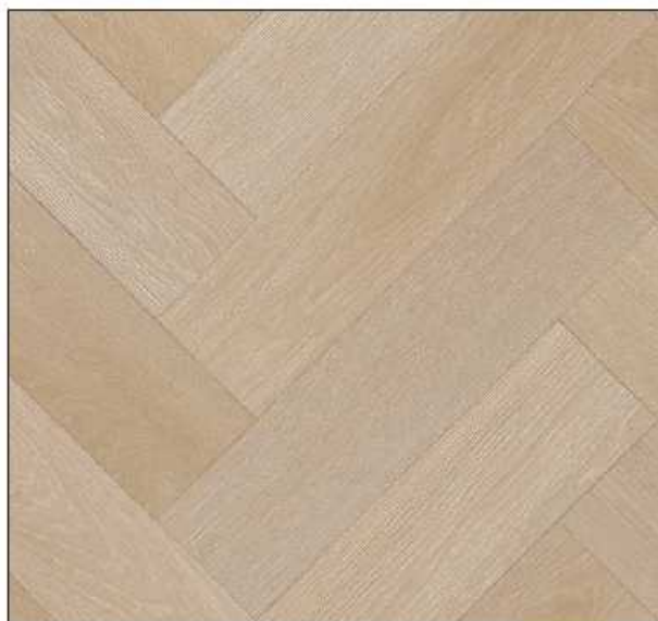
Ancares Herringbone Grege - 5203109