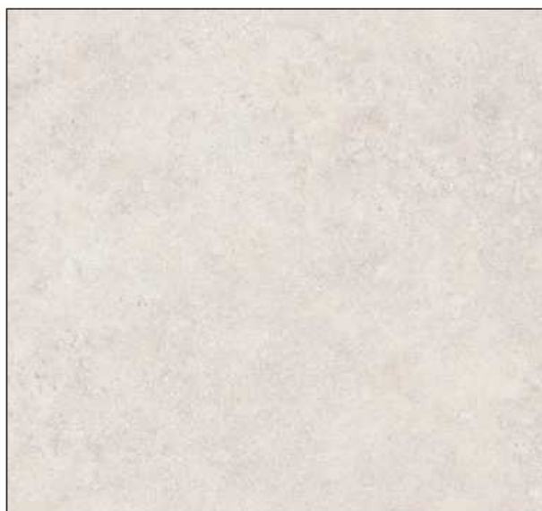
Agrego WHITE - 5203064