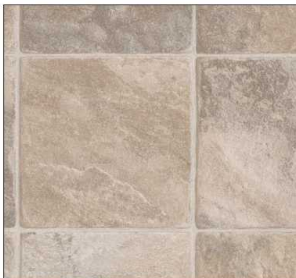
Granit GREGE - 5203059