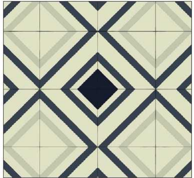
Cabana / Grey - 27123079