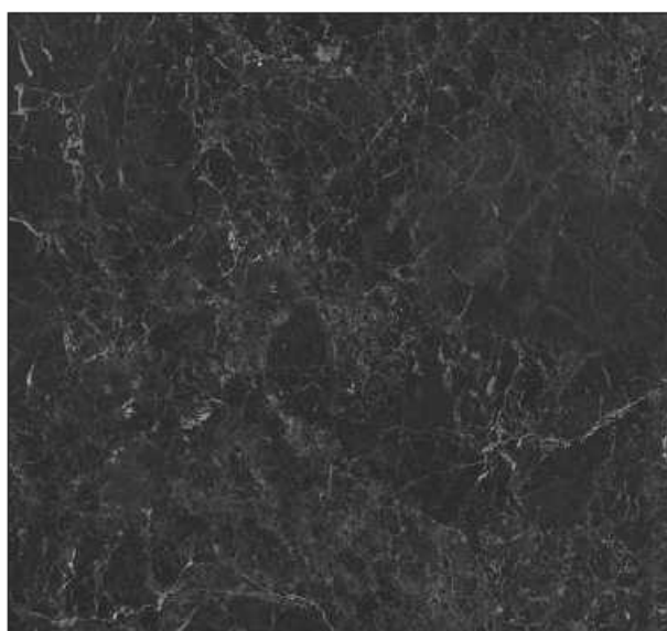
Nero Marquine / Black - 27123134