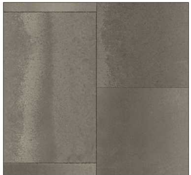
Kaolin / Dark Grege - 27123090