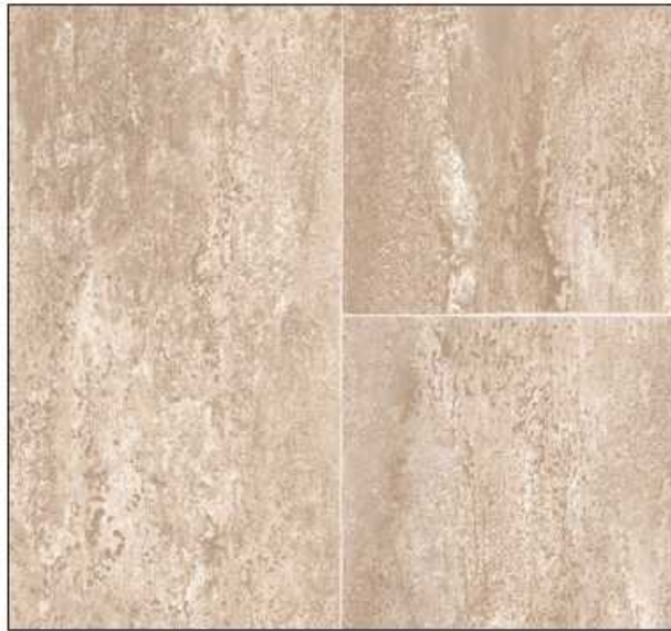
Melbourne / Gris 27123036