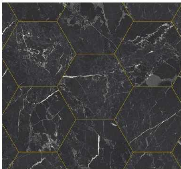
Nero Marquine Hexagon / Gold - 27123008