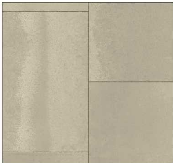
Kaolin / Taupe - 27123091