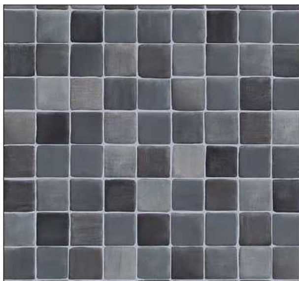
Sarondo / Black - 27123075