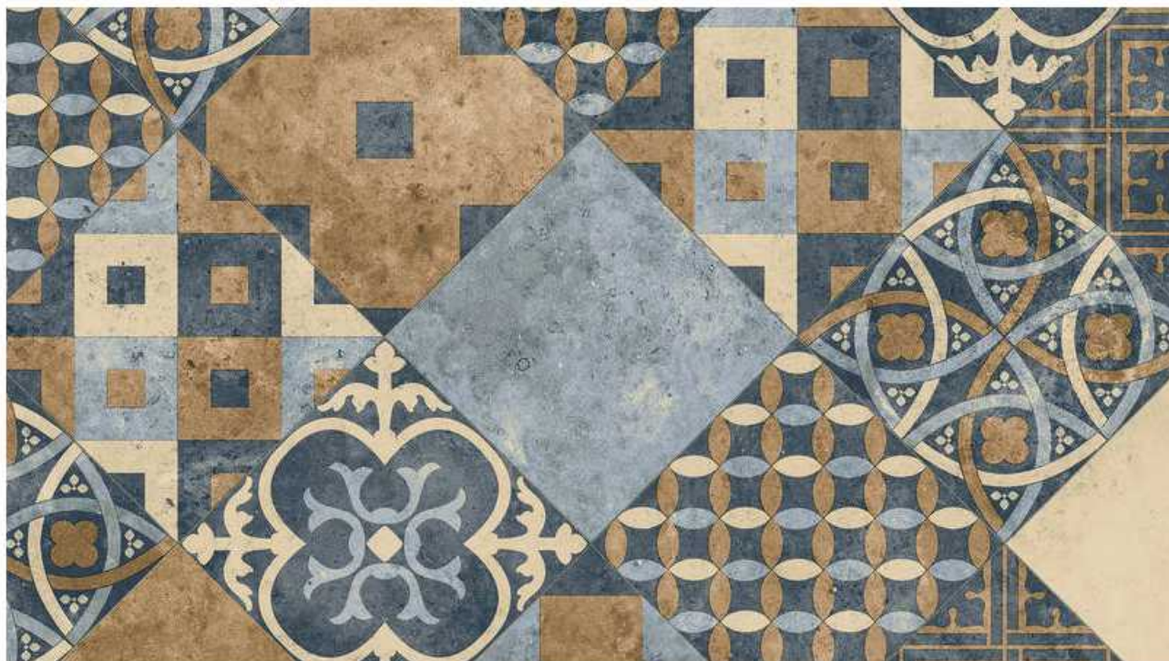
Zaragoza Tile / Indigo - 27123014