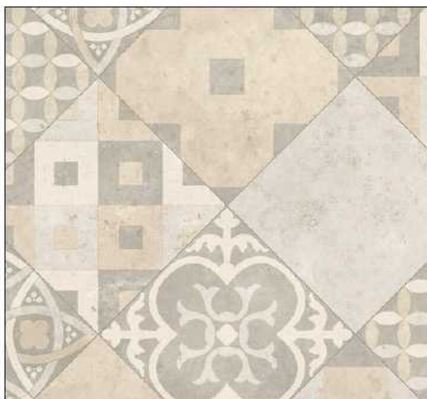
Zaragoza Tile / Powder - 27123069