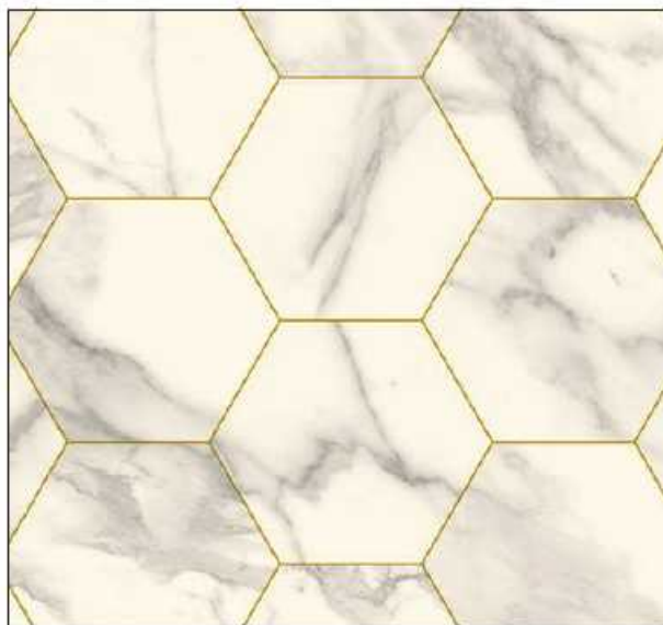
Nero Marquine Hexagon / Gold - 27123007