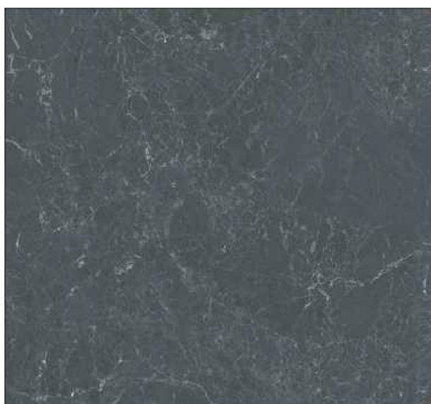
Nero Marquine Anthracite - 27123133