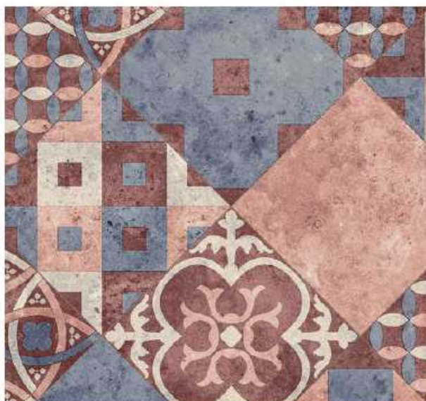
Zaragoza Tile / Ruby - 27123015