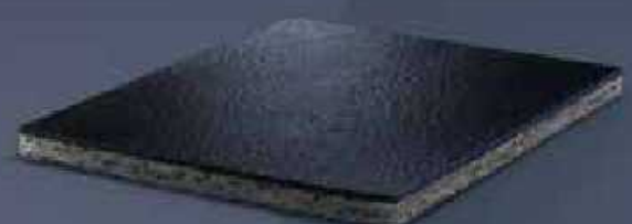
ICE HOCKEY RAMFLEX