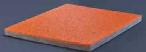
ICE HOCKEY SPORT IMPACT