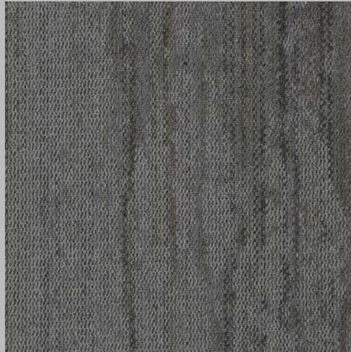
Hard Graft - Shaded: Hype 304