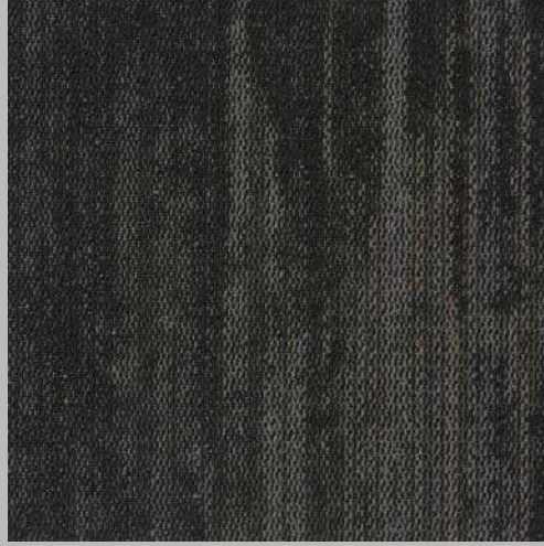
Hard Graft - Shaded: Deep 302