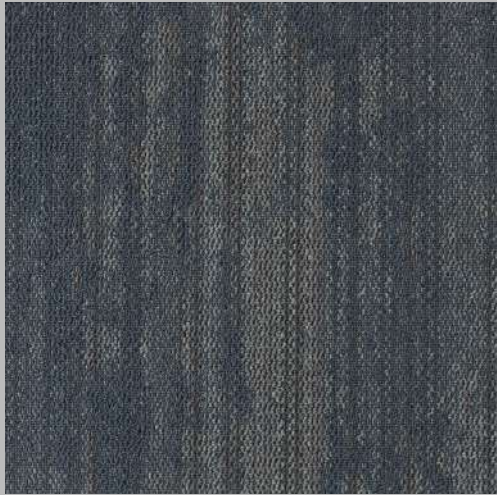
Hard Graft - Shaded: Chill 301