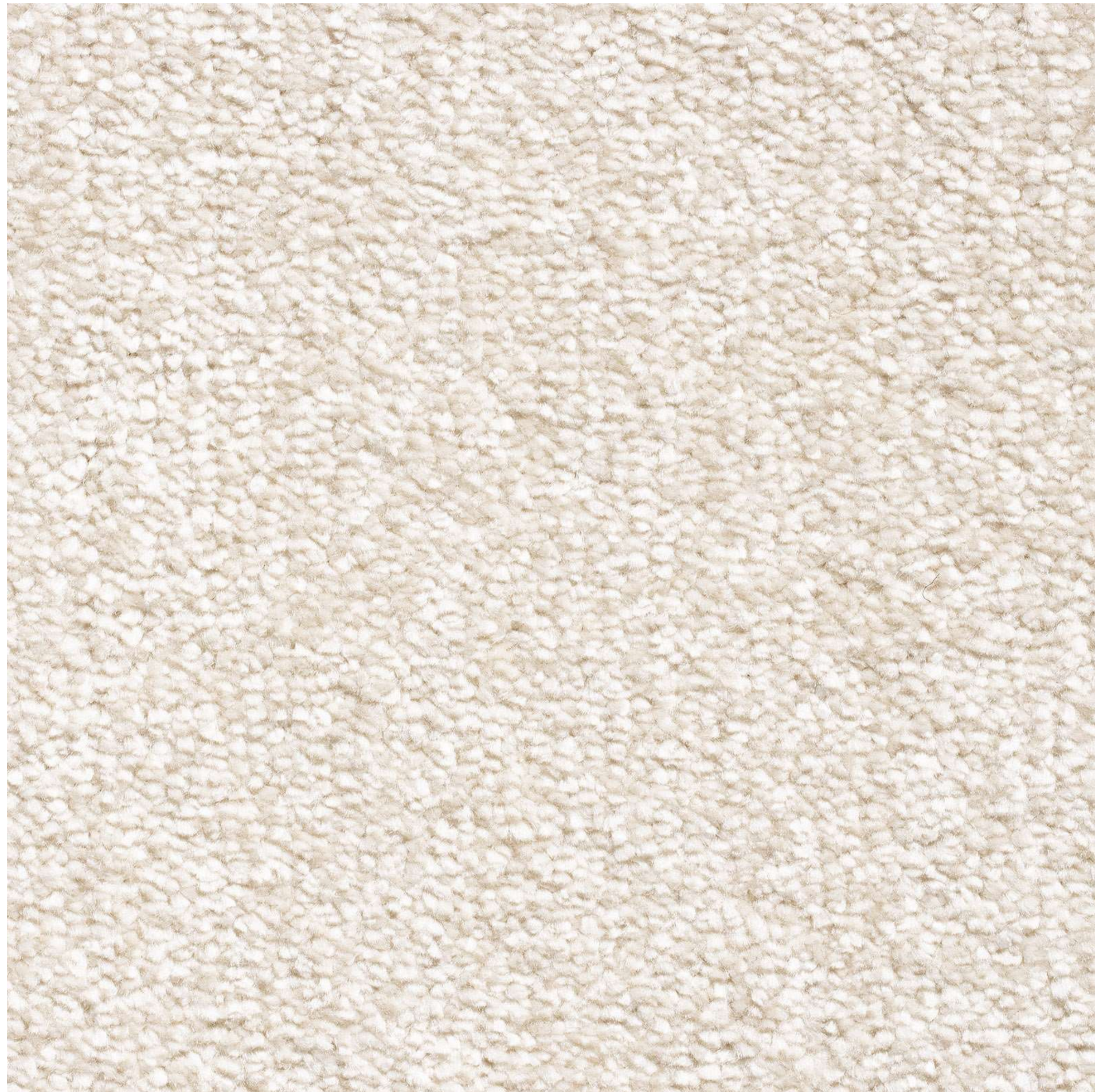
171 - Light Beige