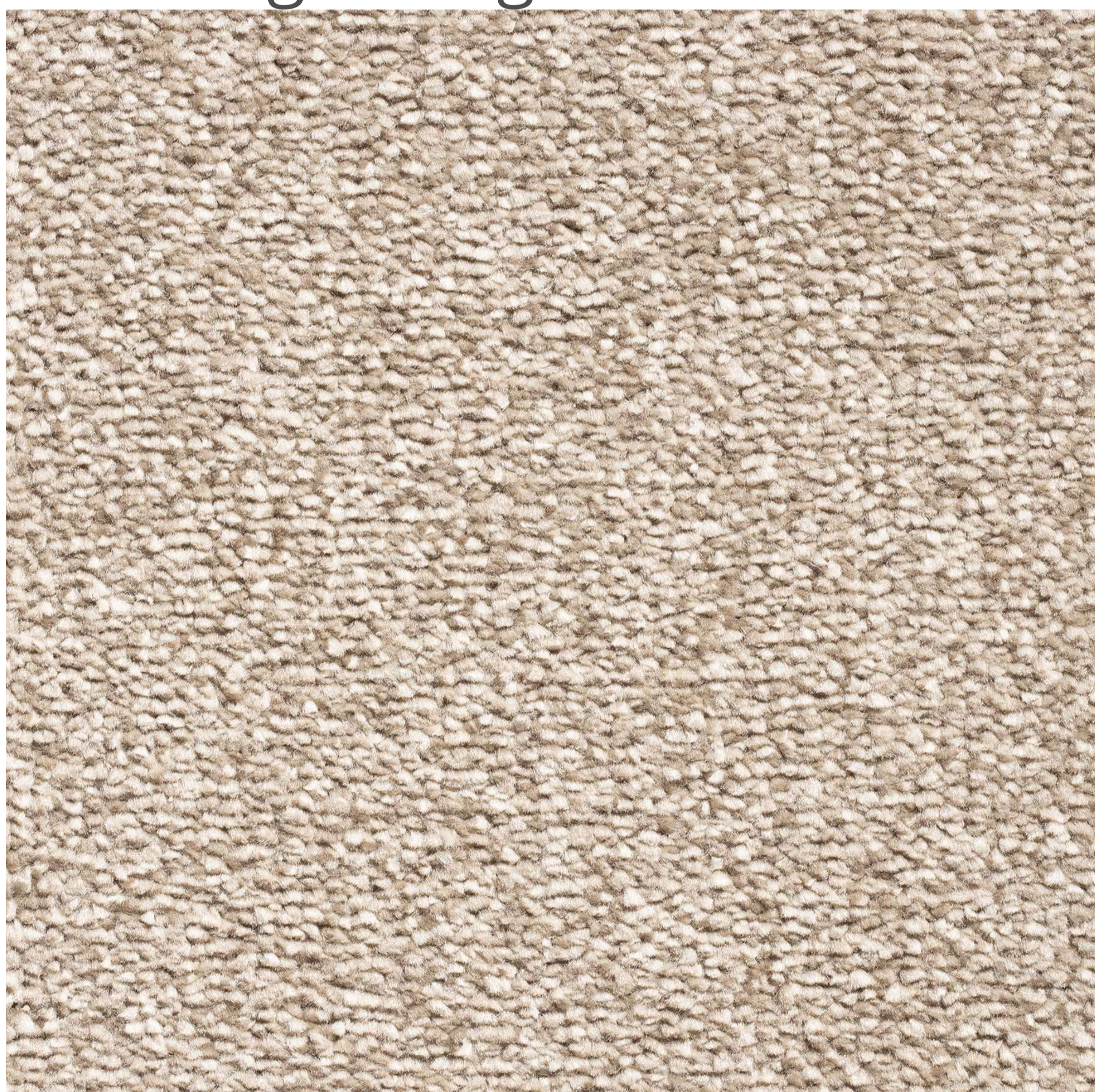
190 - Dark Beige