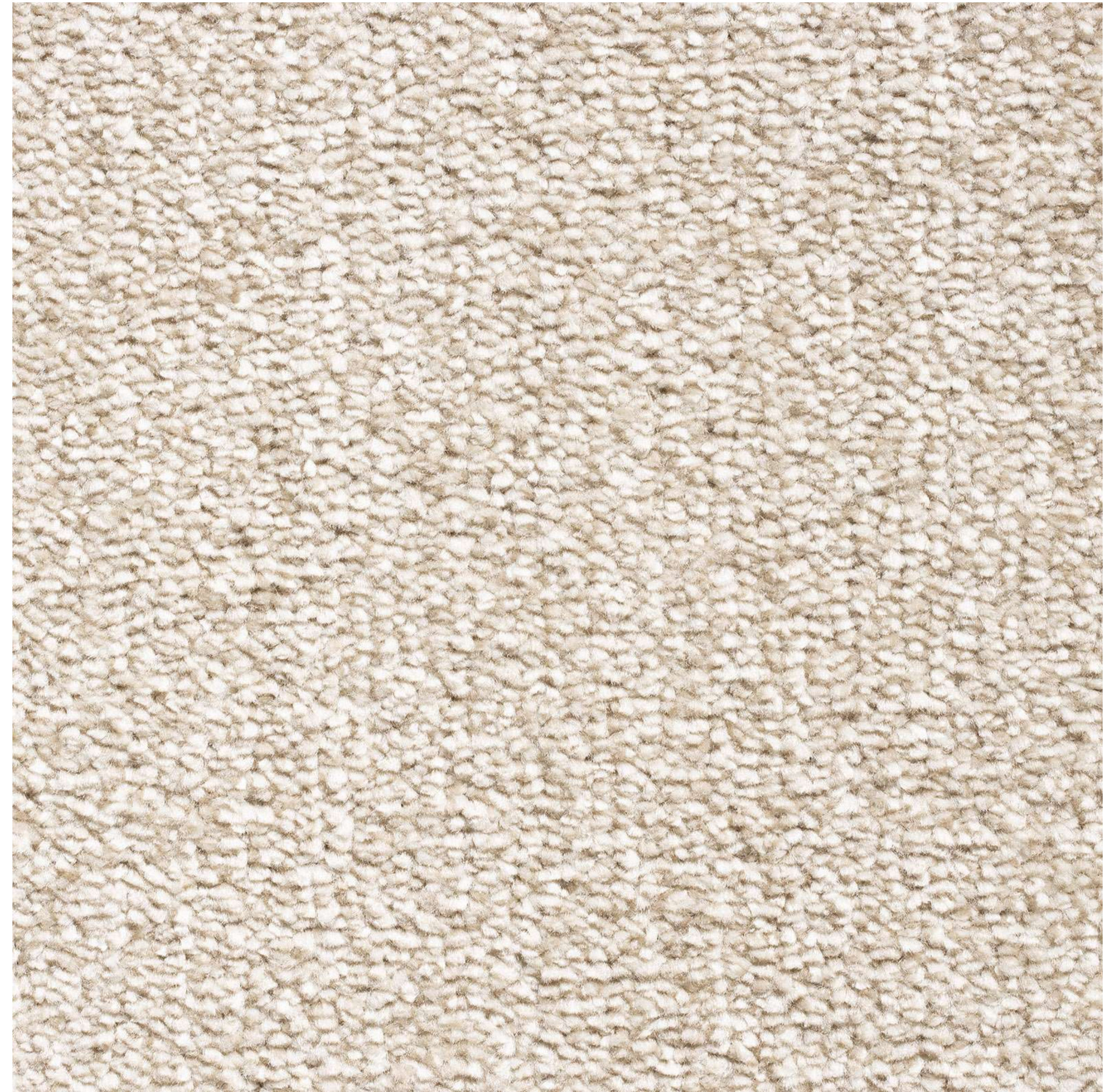
172 - Beige