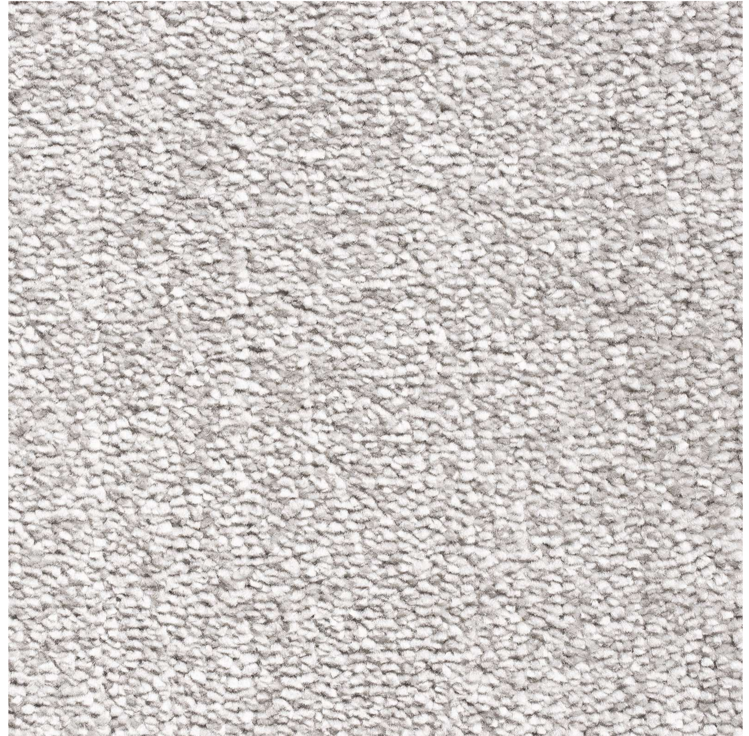
174 - Light Grey