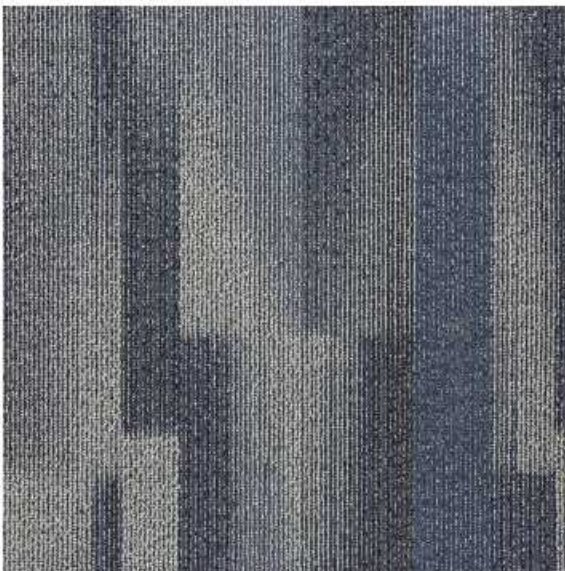
Offset Blue - 206