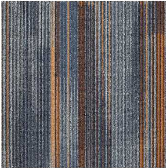
Charcoal Orange - 209