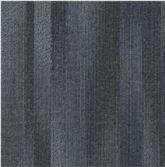
Midnight Black - 201