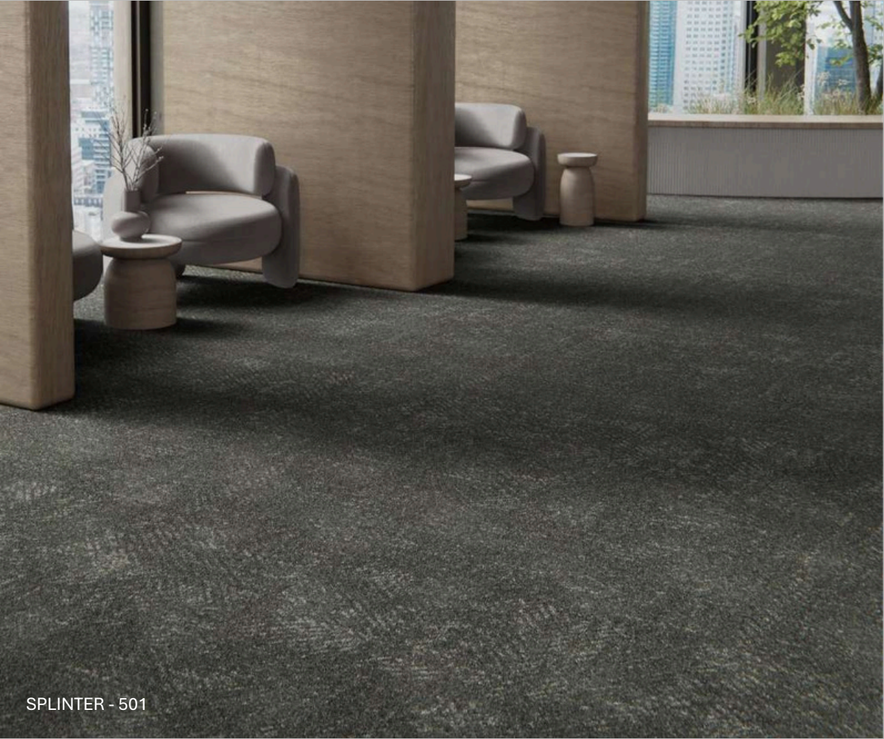
SPLINTER - 501