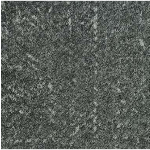
EROS SPLINTER - 501