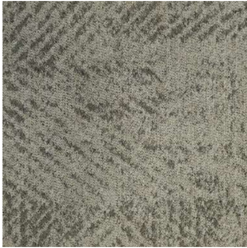
EROS SMOKEY - 504