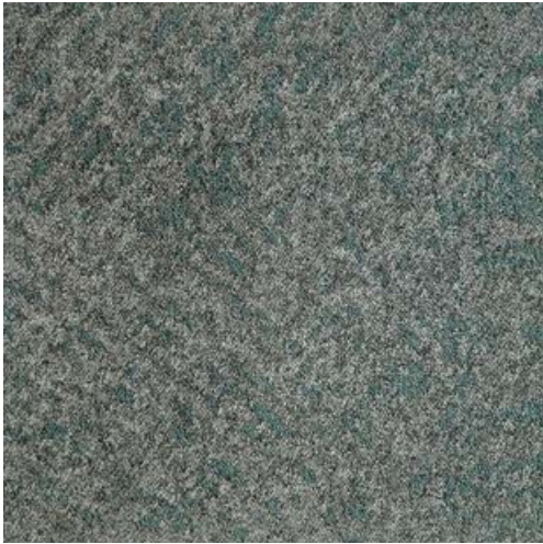
EROS AQUA - 505