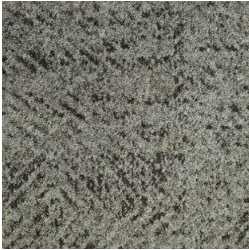
EROS CHOCOLATE - 503