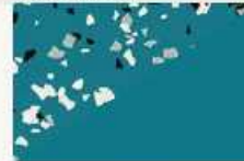
Intense Teal SW 6943