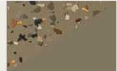
Warm Stone SW 7032