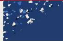
Indigo SW 6531