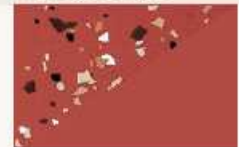
Bold Brick SW 6327