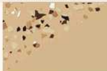
Quinoa SW 9102

A tonal blend of beige, ivory and white.