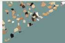
Moody Blue SW 6221