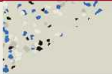
Big Chill SW 7648

A vibrant blend of blue, gray, black and white.