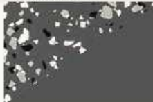
Peppercorn SW 7674

A versatile blend of black, gray and white.