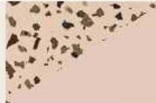
Abalone Shell SW 6050