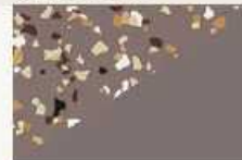
Chinchilla SW 6011