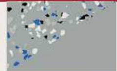
Network Gray SW 7073