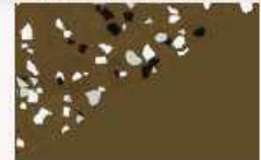
Oliva Oscuro SW 9125