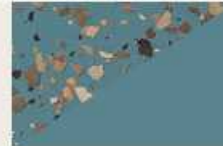
Refuge SW 6228