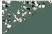
Rocky River SW 6215