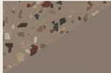
Poised Taupe SW 6039

A nature-inspired blend of rich neutral shades and metallic copper flakes.