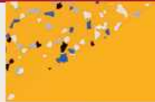
Gusto Gold SW 6904