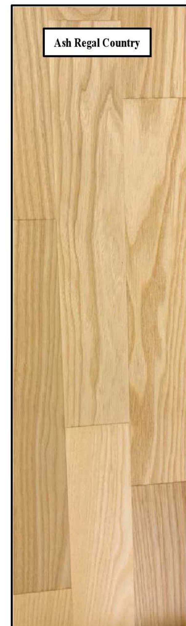
Ash Regal Country