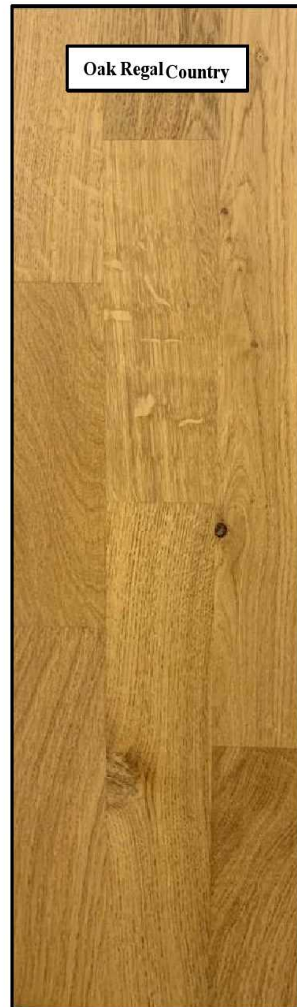
Oak Regal Country