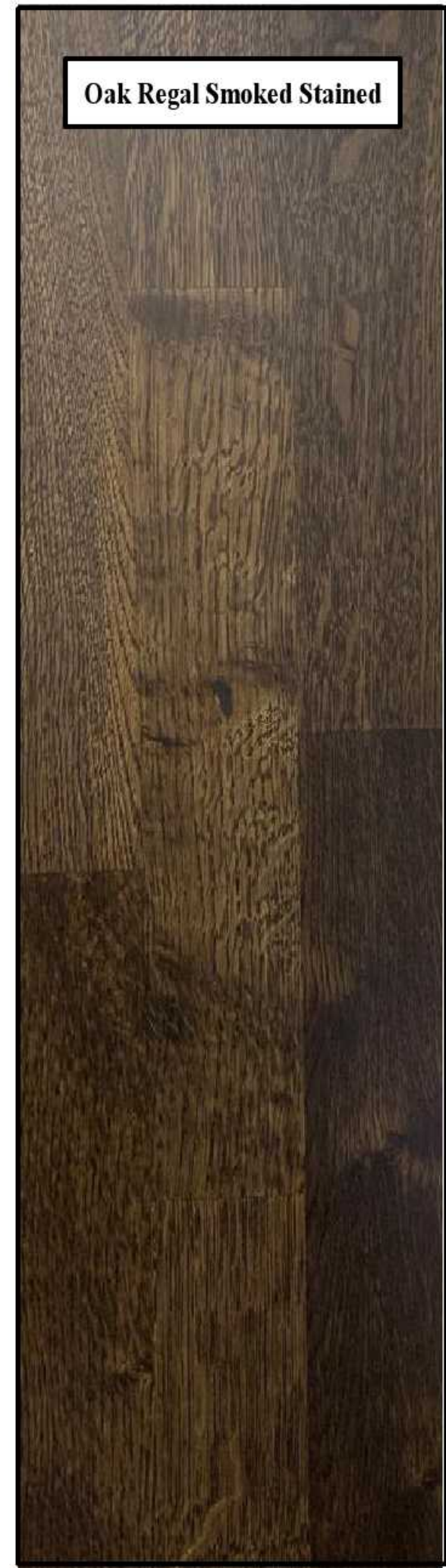
Oak Regal Smoked Stained