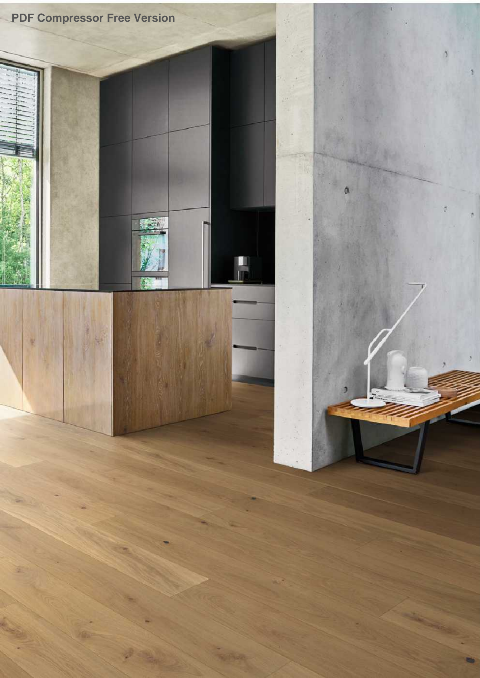
Maple Regal Country