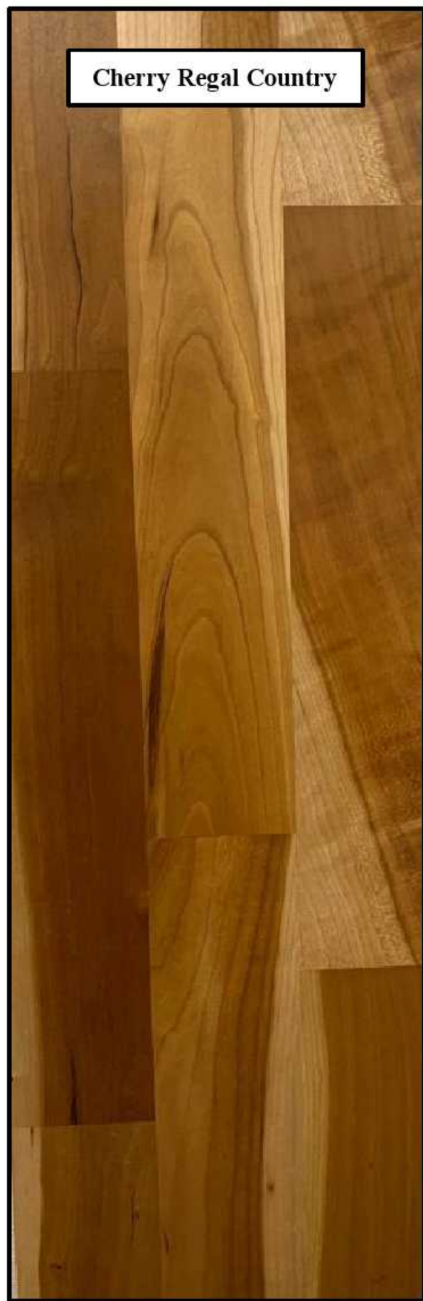
Cherry Regal Country