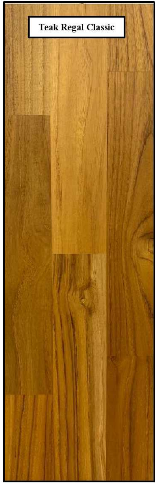
Teak Regal Classic