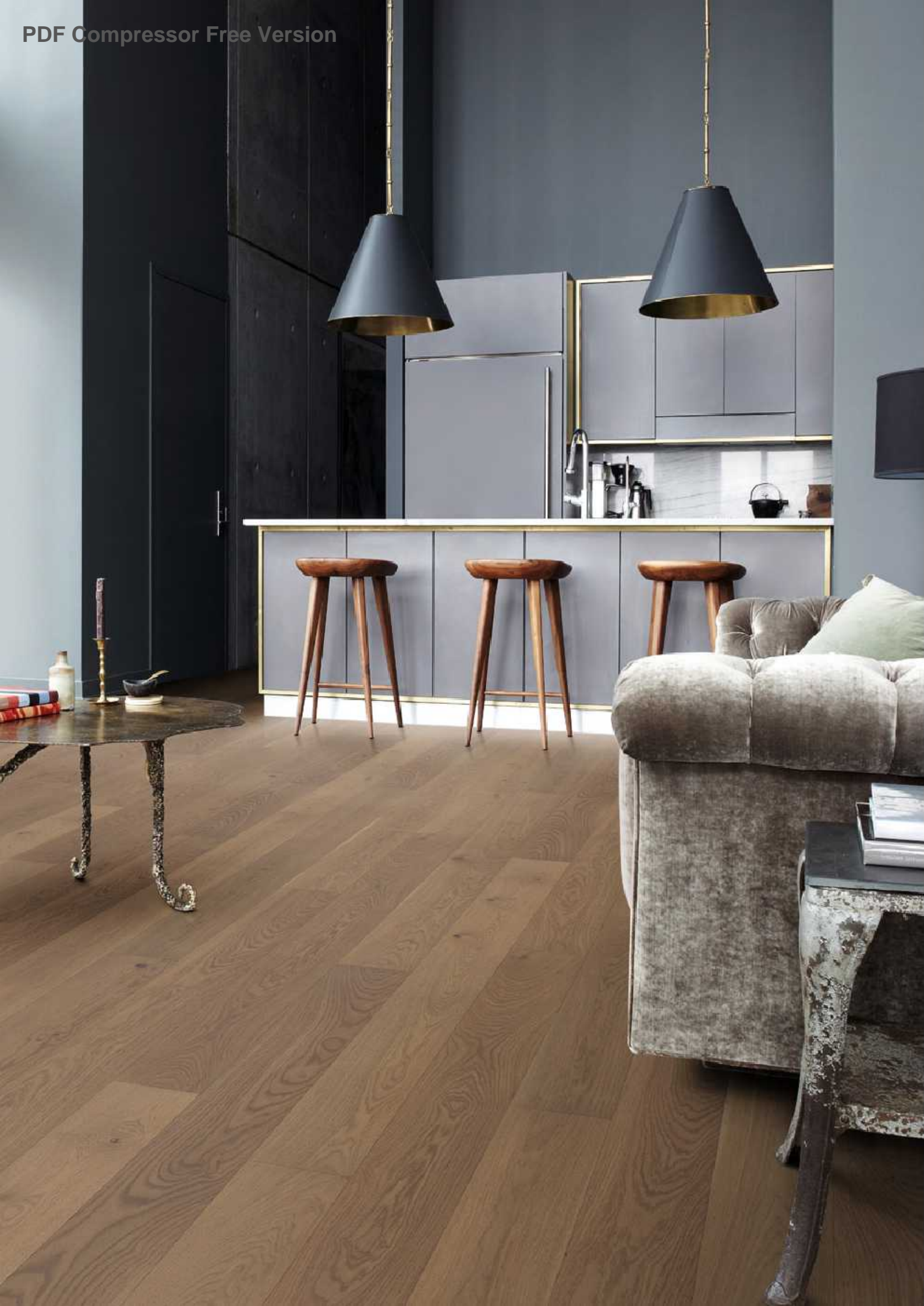
Wenge Regal Classic