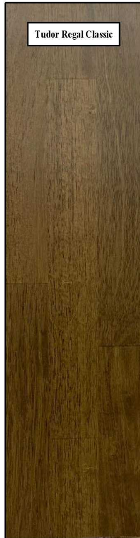
Tudor Regal Classic