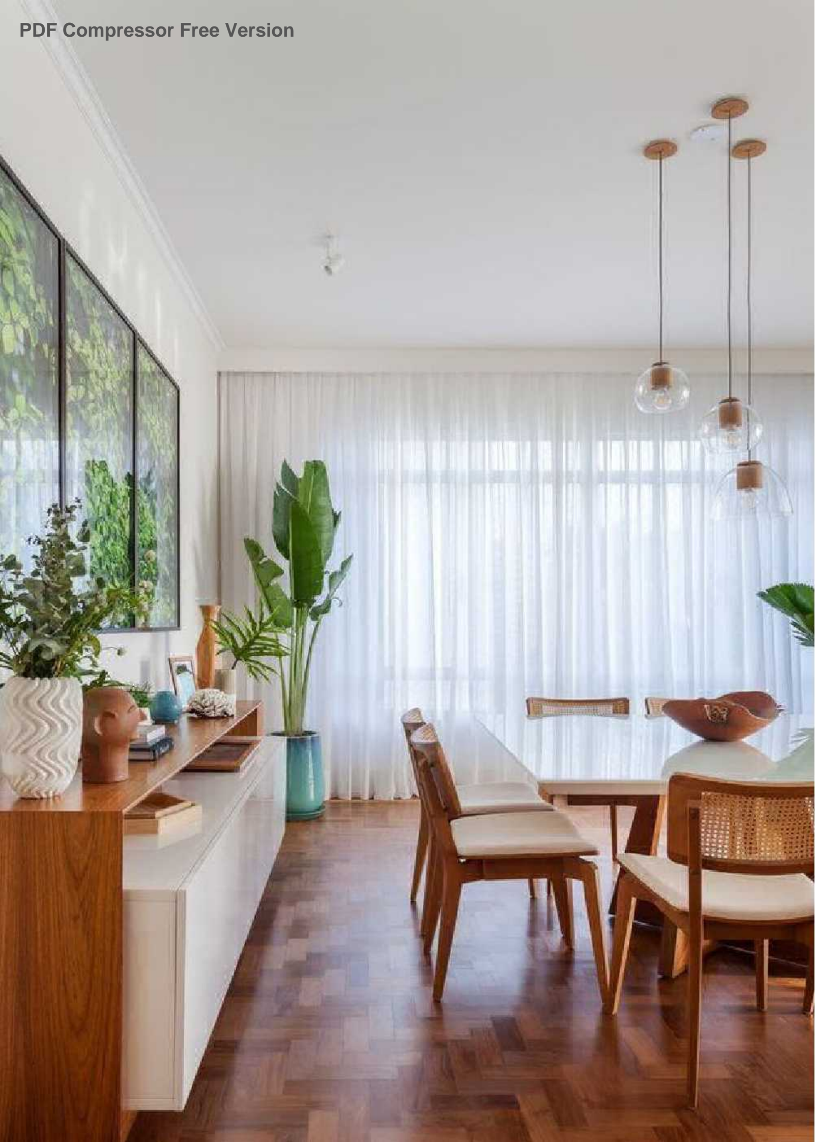
Jatoba Regal Classic