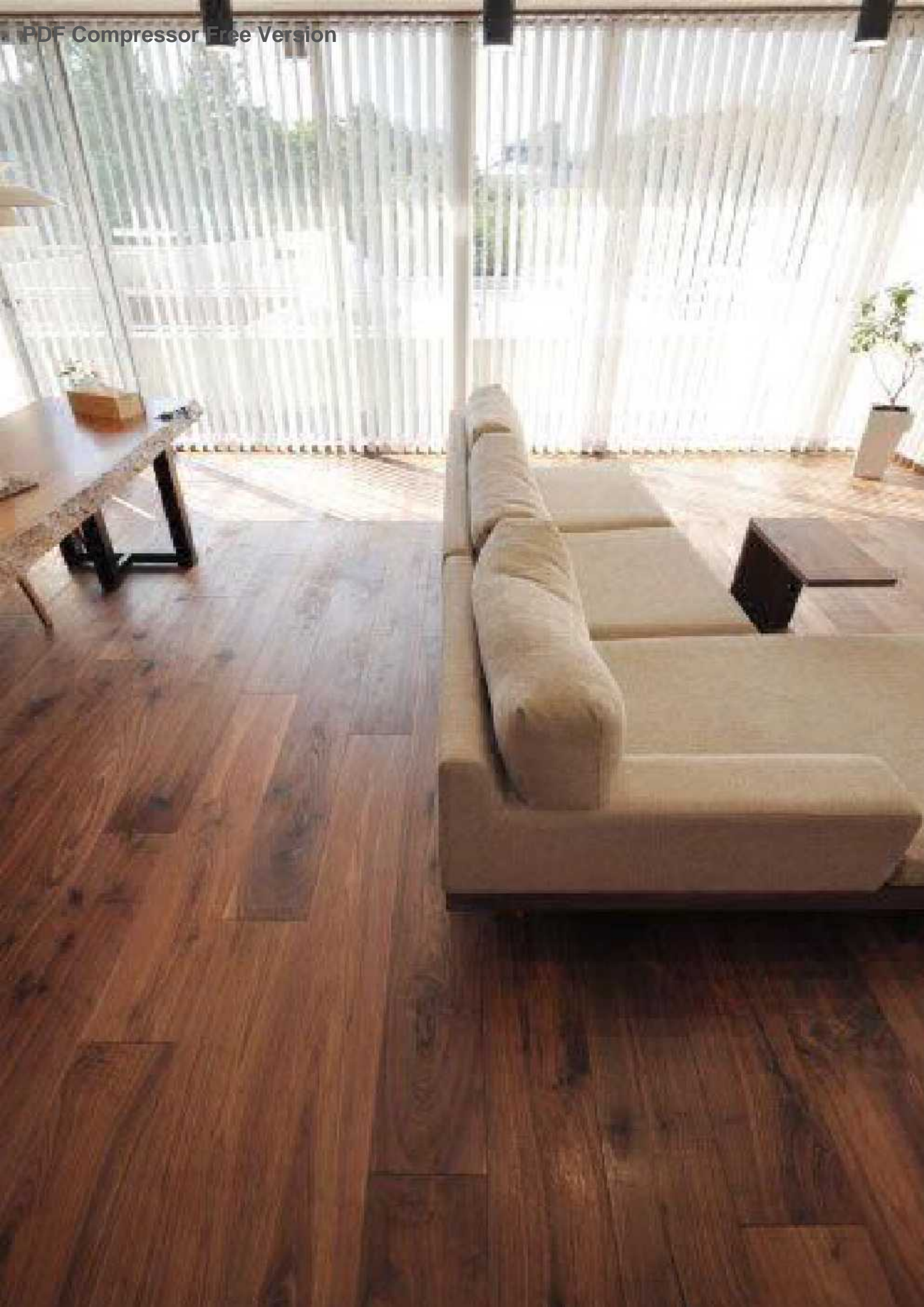
Jarraah Regal Classic