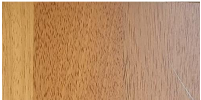
Iroko Regal Classic 3 Strips