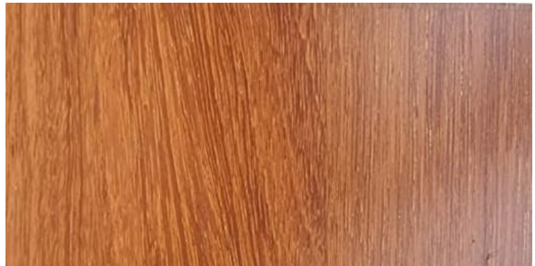
Kempas Regal Classic 3 Strips