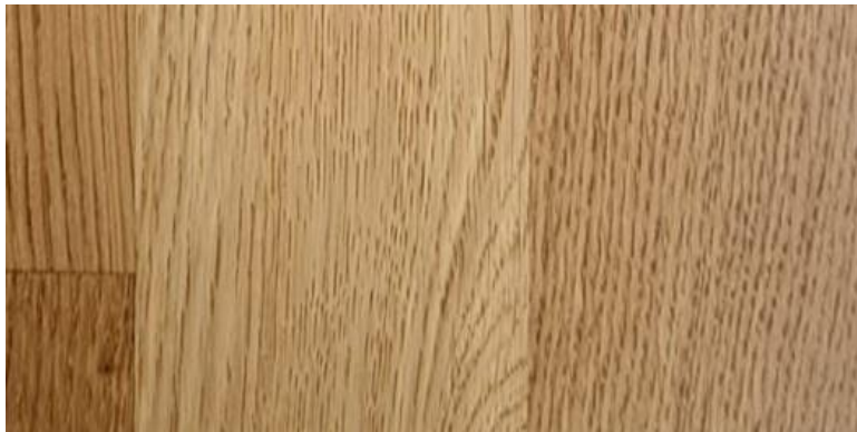
Oak Regal Country 3 Strips