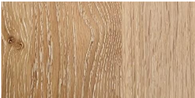
White Stone 3 Strips