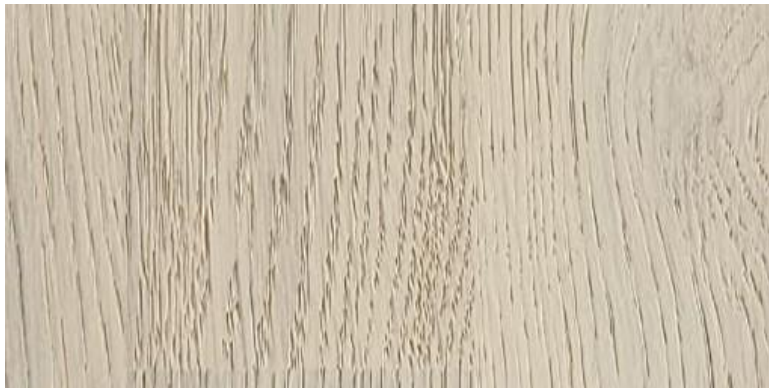
Ivory 3 Strips