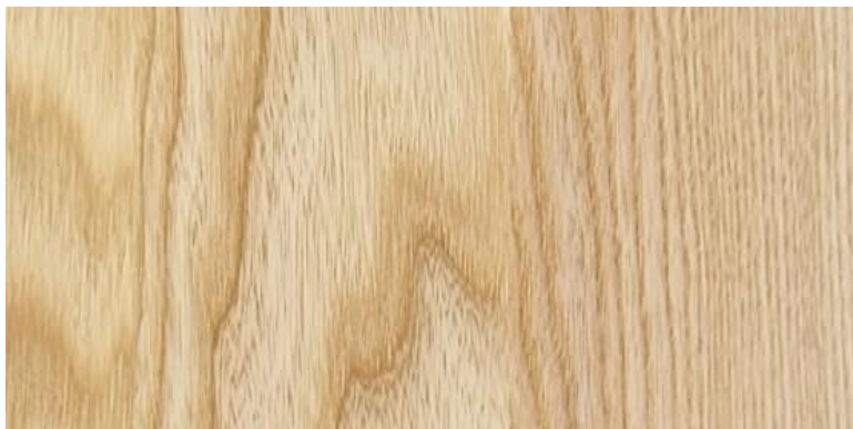
Ash Regal Country 3 Strips