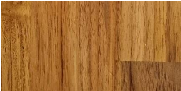
Teak Regal Classic 3 Strips