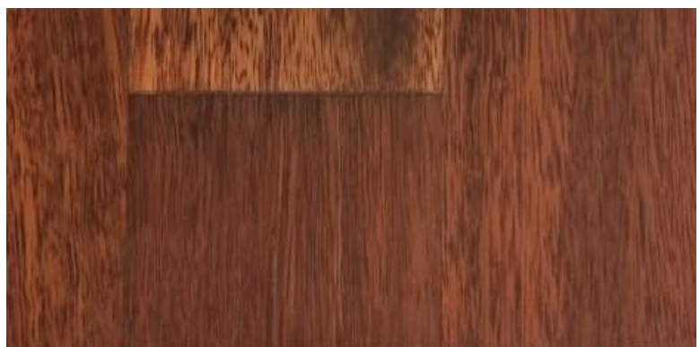
Jarrah Regal Classic 3 Strips