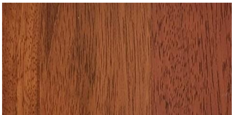
Jatoba Regal Classic 3 Strips