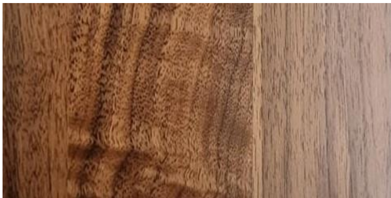
American Walnut 3 Strips