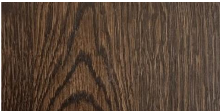
Oak Regal Smoked Stained 3 Strips