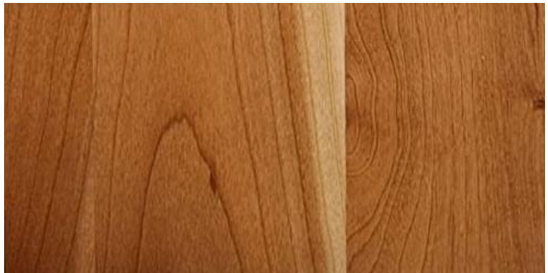
Cherry Country 3 Strips