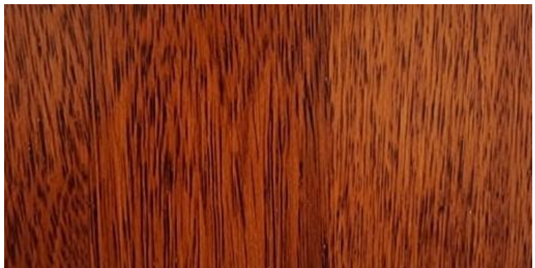
Merbau Regal Classic 3 Strips