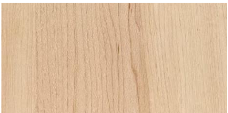
Maple Regal Classic 3 Strips