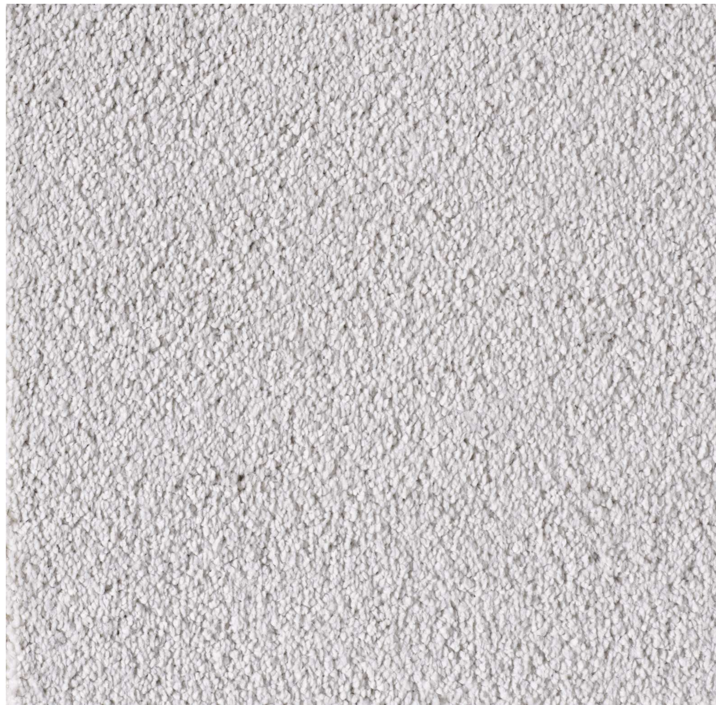
Ice Grey 150