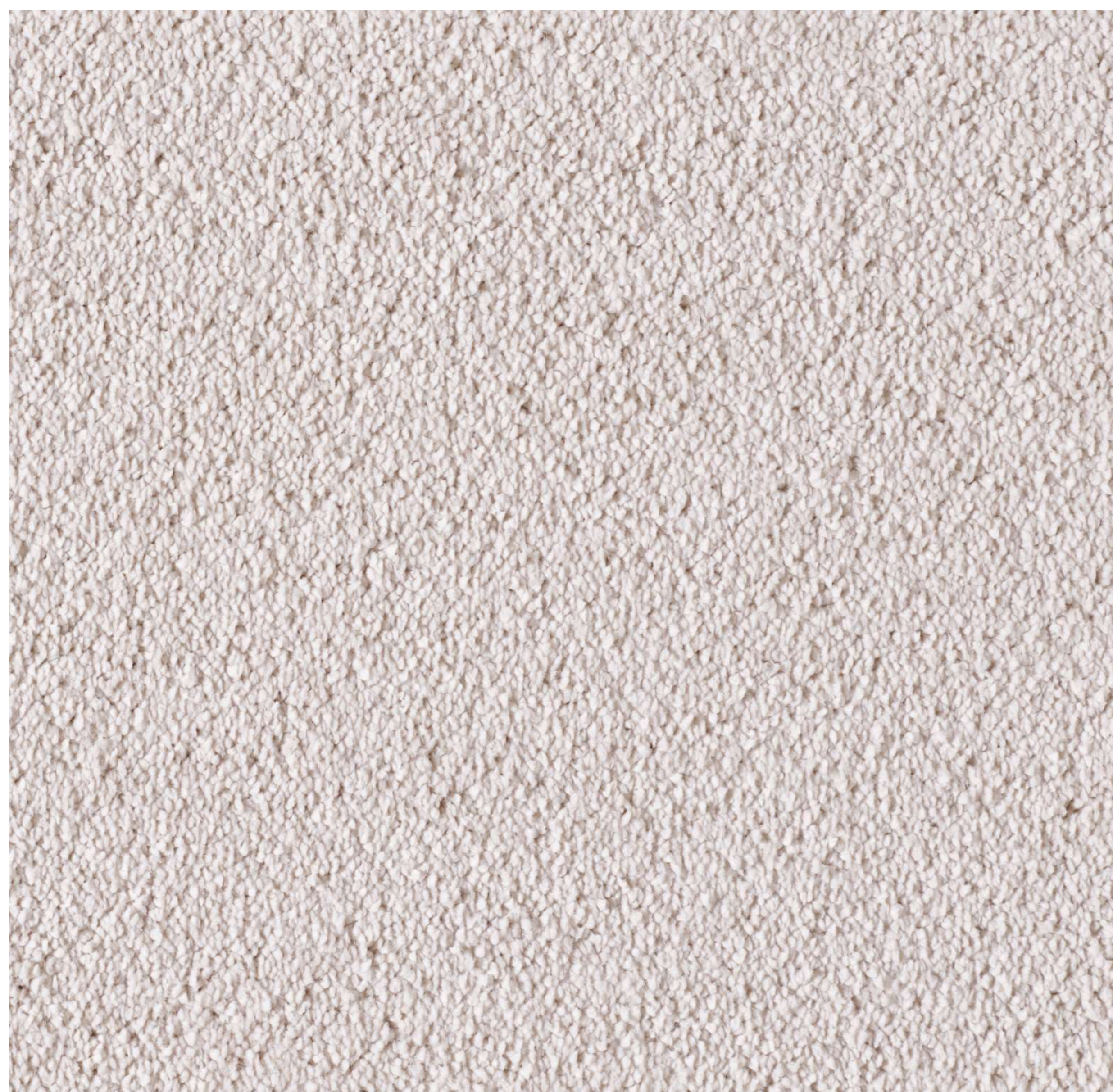
Coral Beige 431