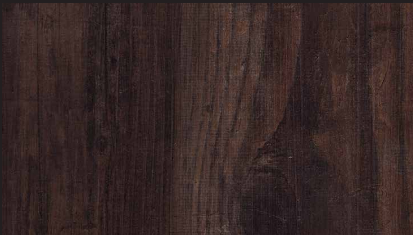
Rustic Forest - 971105