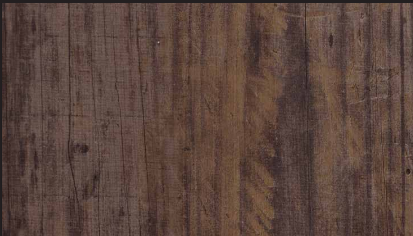
Rustic Nutmeg - 971102