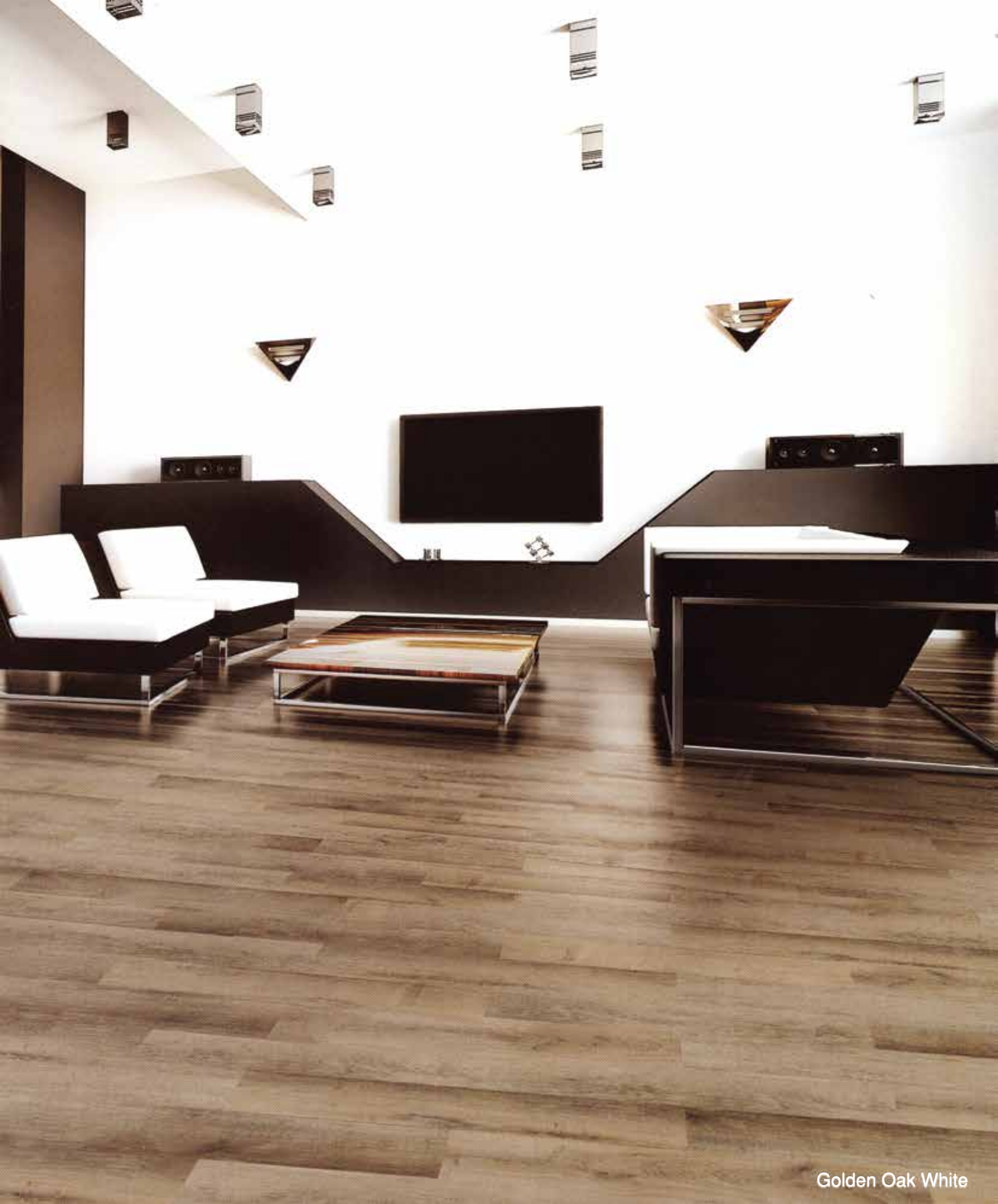
Golden Oak White