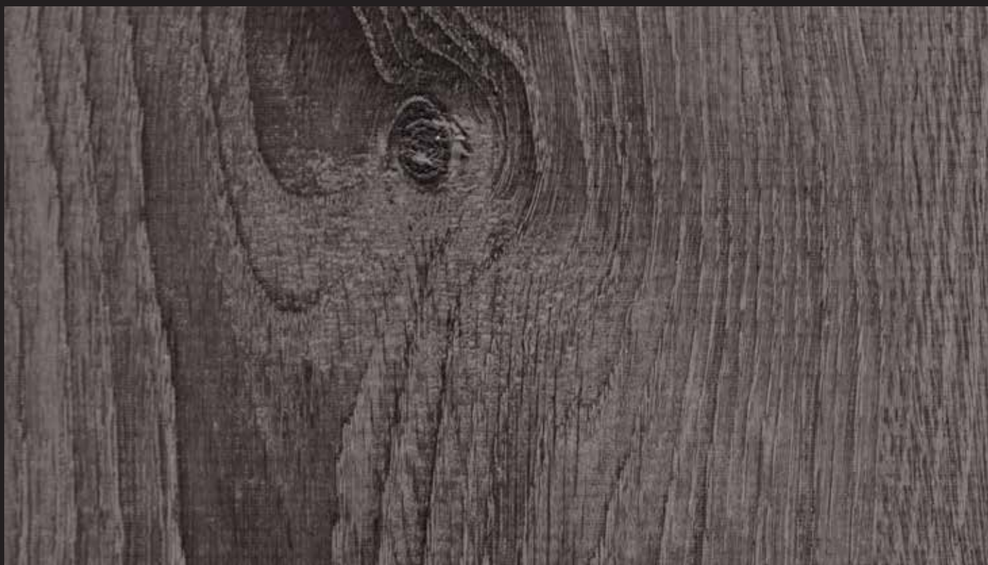
Smoked Oak Grey - 966104

Coating: PU with Ceramic Bead (CB) / Utilization Class: 33/42 / Produced with 100% pure vinyl. Does not contain recycled material and therefore all contents conform to EU standards. EasyLock itself can be completely recycled.