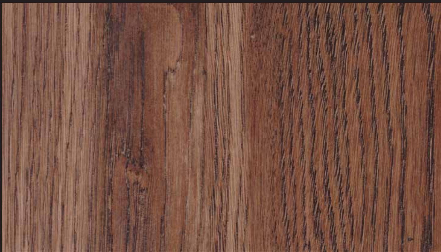
Southern Hickory Red - 100217