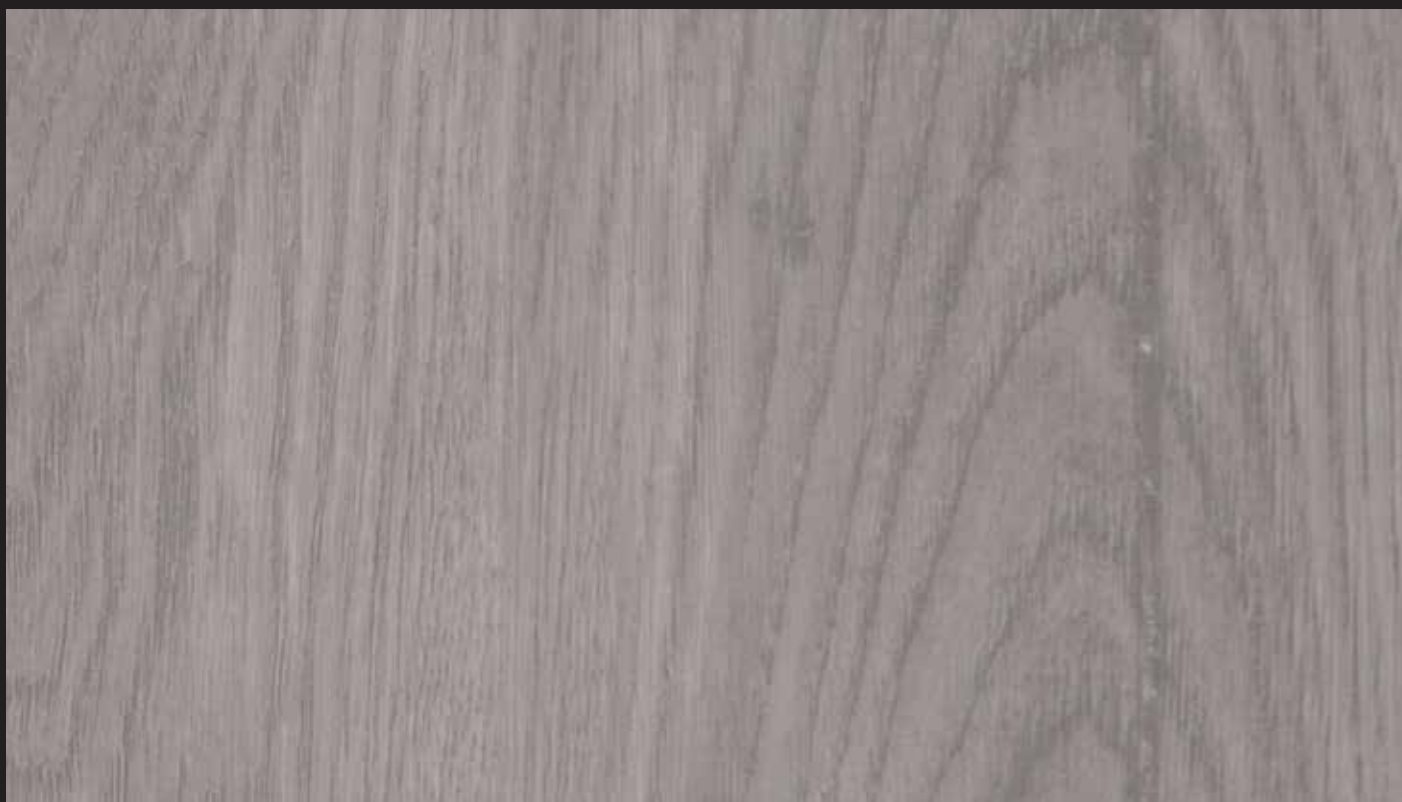
Southern Hickory White - 100211

Coating: PU with Ceramic Bead (CB) / Utilization Class: 33/42 / Produced with 100% pure vinyl. Does not contain recycled material and therefore all contents conform to EU standards. EasyLock itself can be completely recycled.