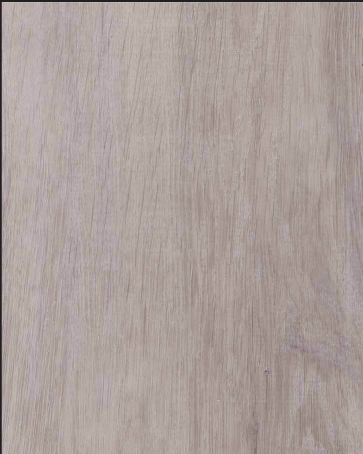
Golden Oak Arctic - 967112

Coating: PU with Ceramic Bead (CB) / Utilization Class: 33/42 / Produced with 100% pure vinyl. Does not contain recycled material and therefore all contents conform to EU standards. EasyLock itself can be completely recycled.