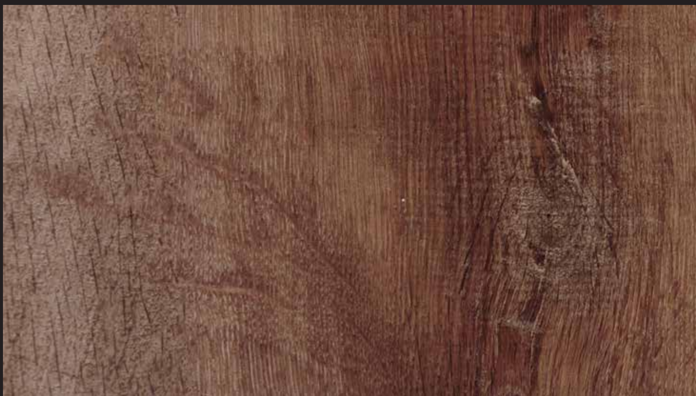
Golden Oak Mocha - 96714