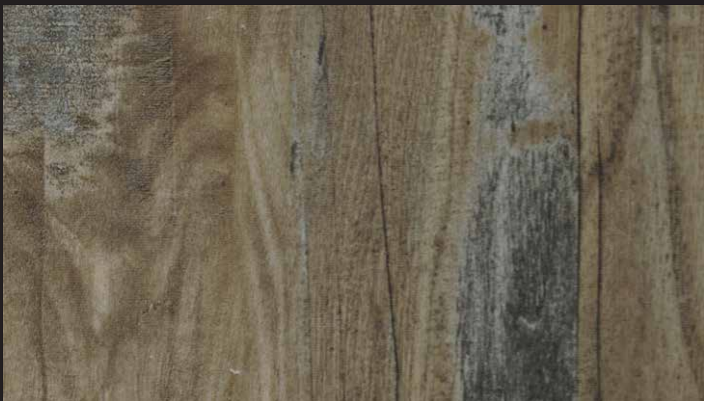
Van Gogh - 969101