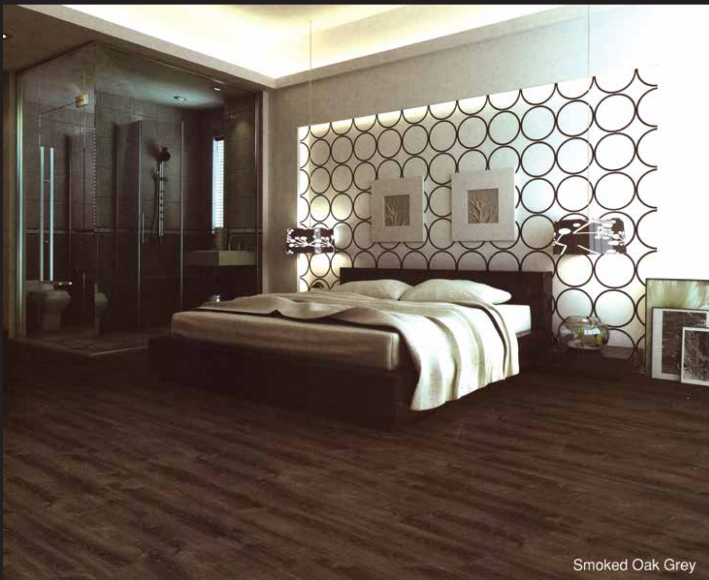
Smoked Oak Grey

Coating: PU with Ceramic Bead (CB) / Utilization Class: 33/42 / Produced with 100% pure vinyl. Does not contain recycled material and therefore all contents conform to EU standards. EasyLock itself can be completely recycled.