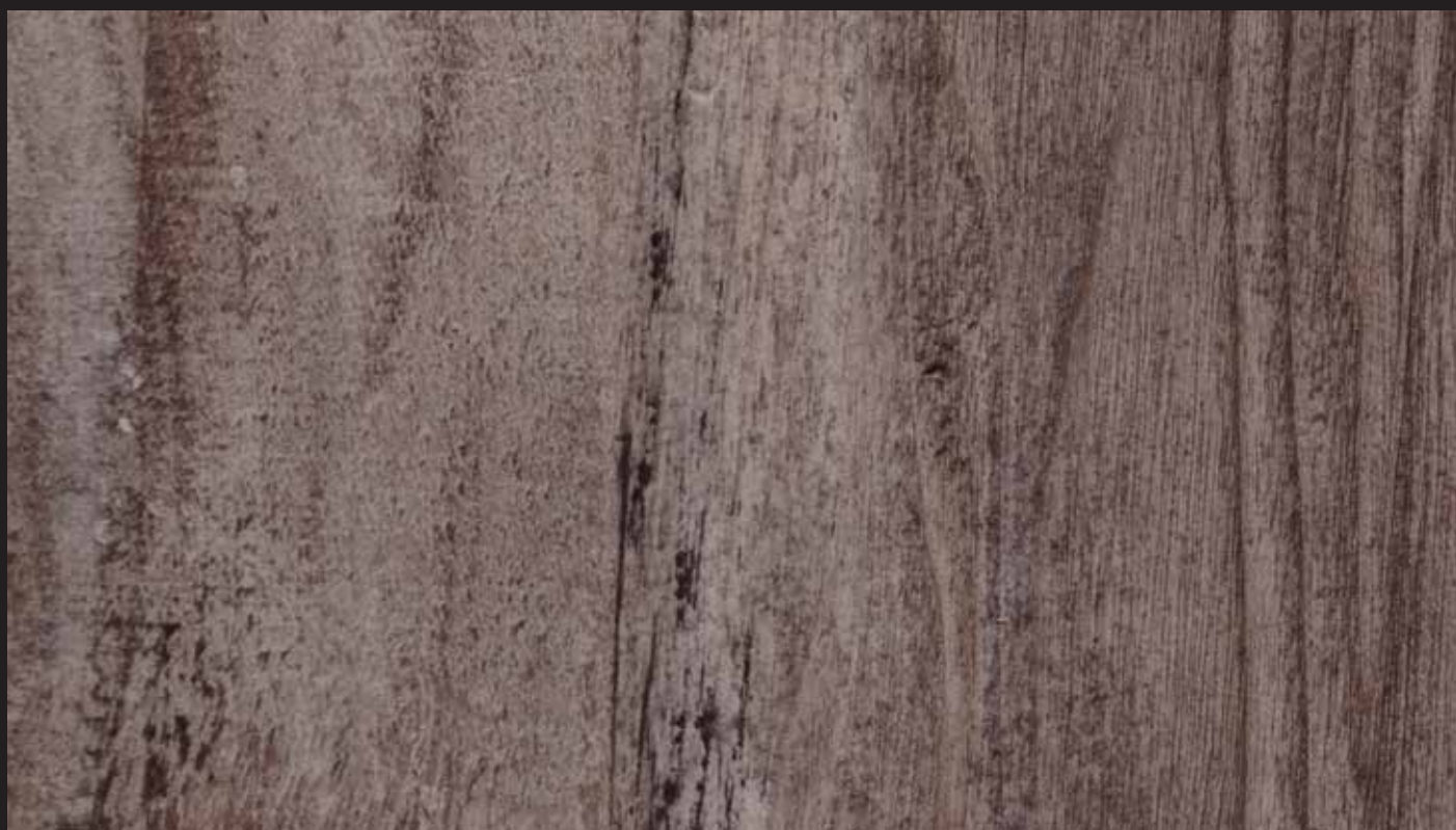
Matisse - 969106