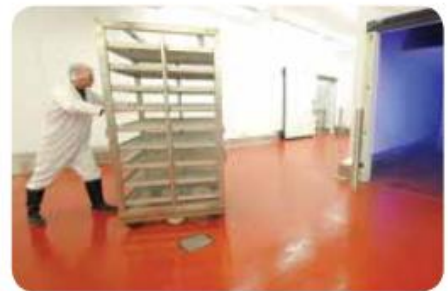
Food and Drink Processing