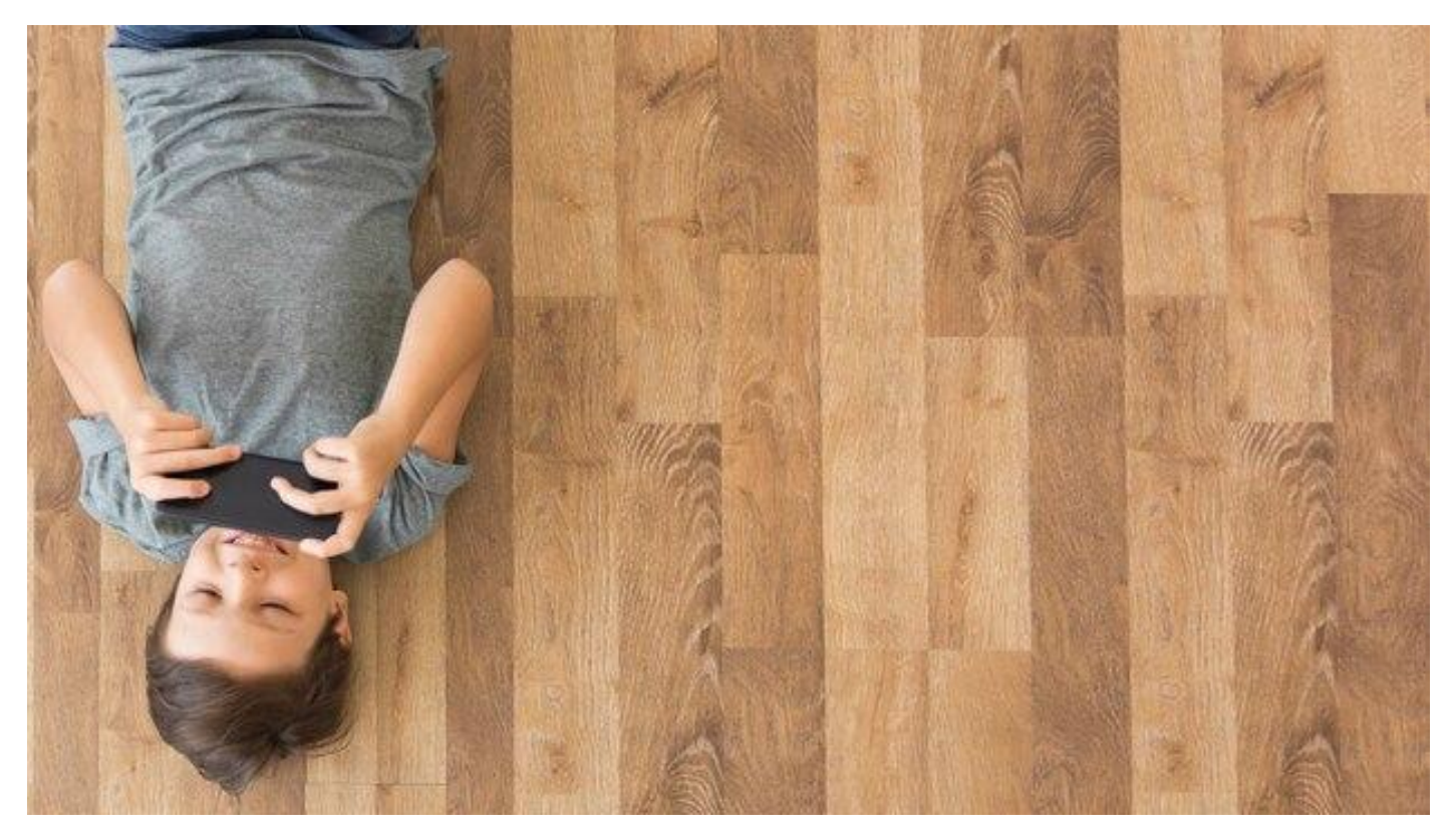
What is LVT Flooring?

At Zayaanco , a leading flooring company in the UAE, we offer a wide range of LVT flooring solutions tailored to suit every style, space, and budget. Whether you're renovating your home or outfitting a high-traffic commercial area, LVT flooring provides the ideal combination of form and function. With over 40 years of experience in the flooring industry, we understand the importance of providing our customers with high-quality, affordable flooring solutions that stand the test of time.