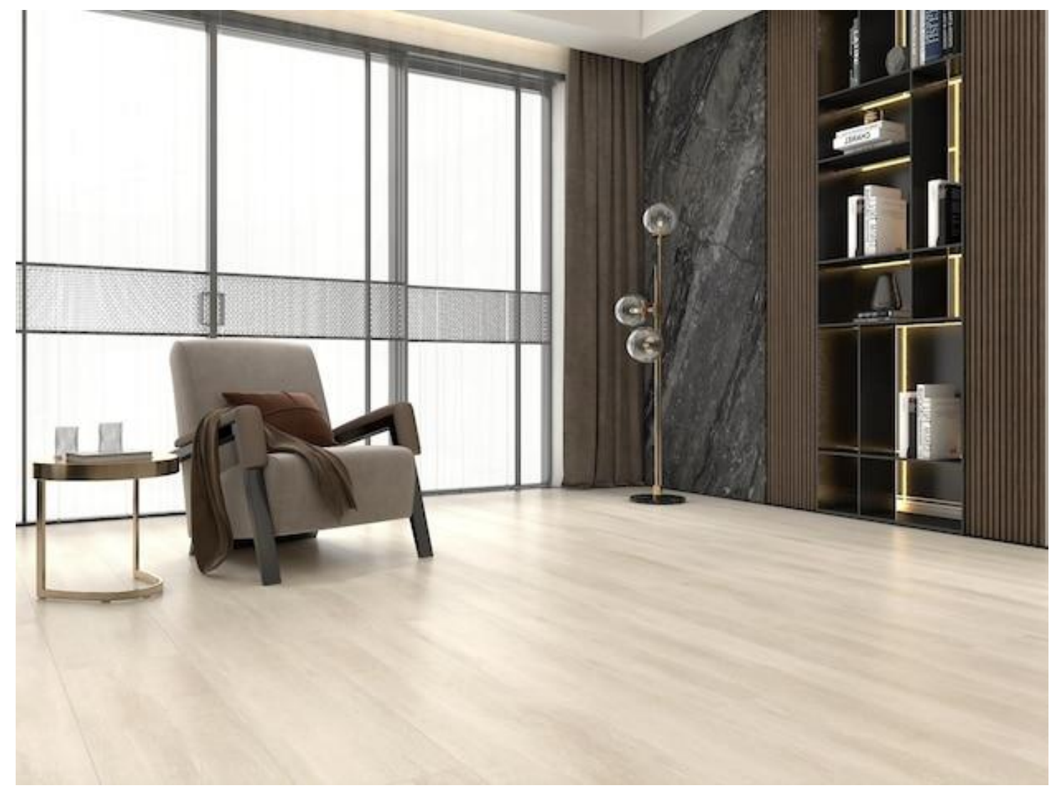
We offer a wide variety of LVT flooring designs, including but not limited to: