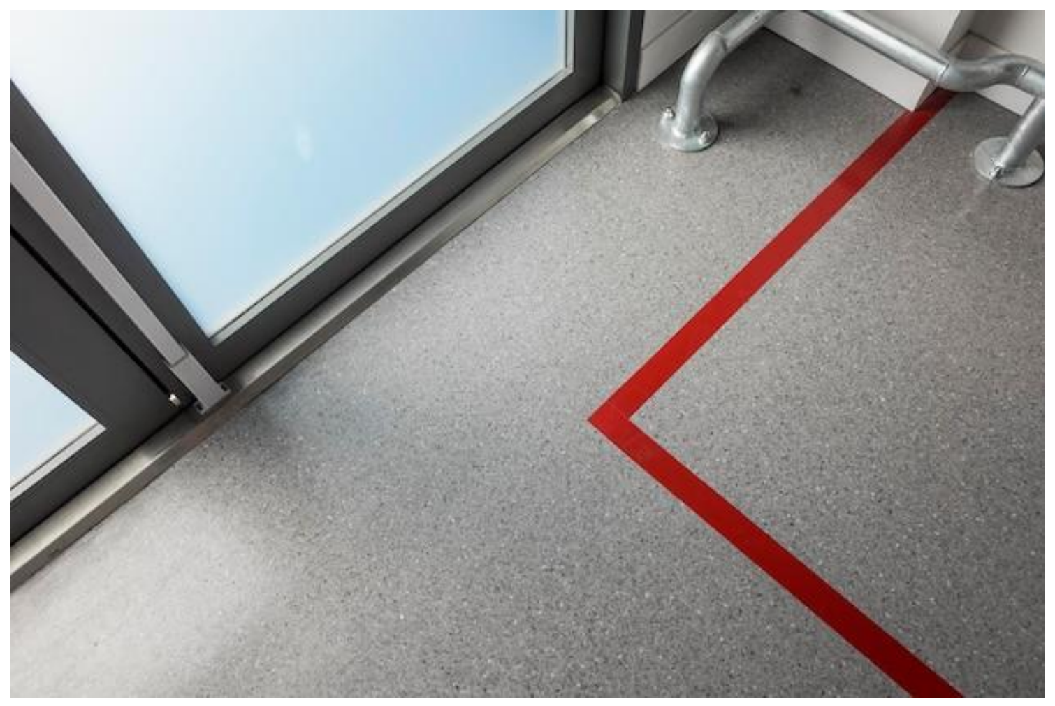
Industries We Serve

ZAYAANCO serves a variety of industries that require antistatic protection for their operations. Some of the industries we serve include: